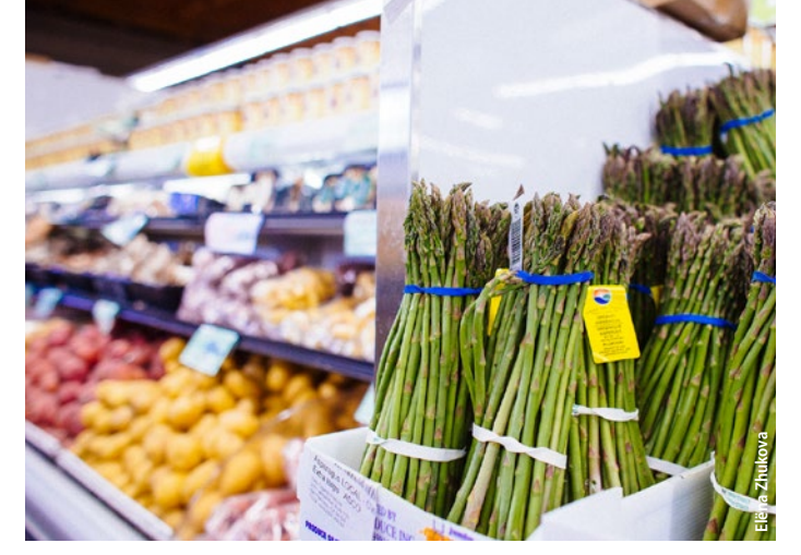
Researchers determined that while large grocery stores in low-income areas generally offered high-quality produce, they charged 27% more for produce, on average, than comparison supermarkets. Convenience stores, meanwhile, charged more than twice as much, on average, for lower-quality produce.