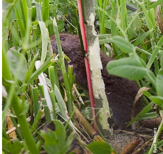
Anthraquinone application, left. Anthraquinone, a naturally occurring compound used as bird repellent, can reduce the girdling of fruit trees and vines by voles, right. In a trial using citrus trees, researchers found it reduced vole girdling by 90% to 100%.