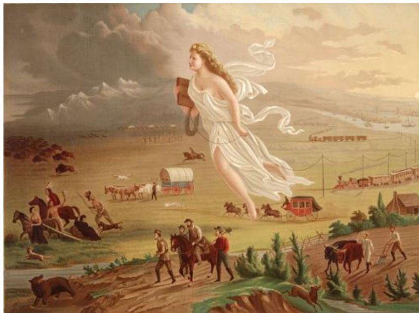
Figure 8.1: George A. Crofutt, American Progress , 1873, chromolithograph after an 1872 painting of the same title by John Gast, Library of Congress, Prints and Photographs Division [LC-USZ62-737].

Interestingly, she is a woman—hardly the forerunner of frontier travel, and hardly the builder of the telegraph lines she grasps or the railroads that run in the wake of her flowing, white dress. Furthermore, she is nothing like the women who graced America’s frontier when the first railroads, wagons, stagecoaches and travelers arrived. Her skin gleams alabaster white, her hair is yellow as corn-silk, and she floats languidly through the sky rather than charging forward on a horse or even looking over her shoulder to rally the migrants onward. This is not Cooper’s Cora, confronting wild Indians on the northeastern frontier; this is not Pocahontas or any of her emulators, pointing white men through the thickets of the New World wilderness; this is not Isora, the “Queen of the Banditti,” charging her horse through the secret Mexican bandit haunts of the southwestern borderlands. This is, instead, a visual representation of the snowy-skinned, faint-hearted, pure white women whom literature found so unsuited for frontier living. By 1872, then, brave, dark-skinned Cora’s death has been mourned and it is the fair Alice who, paradoxically, leads the charge into the “wild” West.