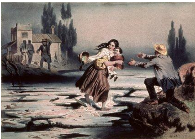
Figure 0.1: This illustration from Uncle Tom's Cabin shows the famous scene of the quadroon Eliza—a classic “tragic mulatta”—leaping across the ice floes of the Ohio River to save herself and her child from slave-catchers. Charles Bour, “Eliza’s Flight,” ca.1860, colored lithograph, Courtesy of the New York Historical Society, U.S.A/ The Bridgeman Art Library.