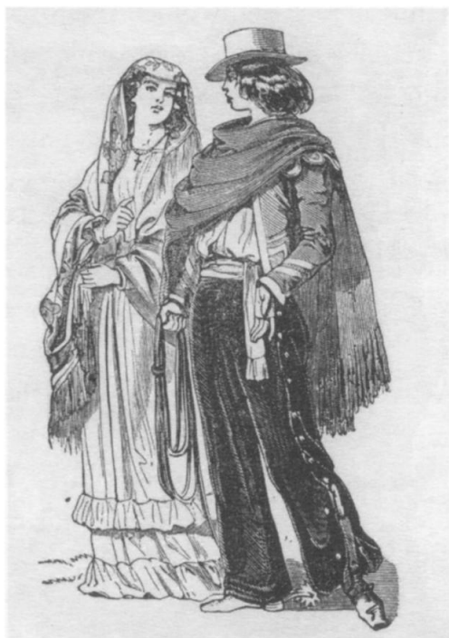
Figure 0.3: This image appeared in a special 1857 issue of Hutchings California Magazine titled “The World in California.” The image itself was titled “Californios,” and purported to depict native Californians of Mexican descent. The woman appears extremely white, virginal, and well-dressed, while her male companion seems rather effeminate in both his features, stance, and dress. Such depictions reflected contemporary, Anglo-American stereotypes. “Californios,” Hutchings California Magazine , 1857, Courtesy of California State Library.

Such a fantasy is the third reason I posit for the contradiction of antebellum interracial sex, and the pivot upon which my overarching argument rests. I hold that a variety of social, cultural, and economic factors in the antebellum period intersected to create significant sexual and marital disadvantages for white women. I term the confrontation of these forces a “crisis of femininity.” This, I believe, is the main reason white men increasingly sought out non-white women for sex or even marriage. I use the term “crisis” for two main reasons. Firstly, the word connotes a period of flux and upheaval culminating in a decisive change. This is useful for the construction of my final chapter, which will examine the ways white women themselves were involved in the crisis’s resolution. The term also connotes danger, which is apt for the description of changes that actually threatened societal order. Secondly, the term echoes the historical notion of a nineteenth-century “crisis of masculinity,” which scholars use to describe the changes in gender norms caused by the Industrial Revolution and the backlash against “soft,” effeminate, middle-class culture. 24 I specifically chose to echo this recognizable concept because