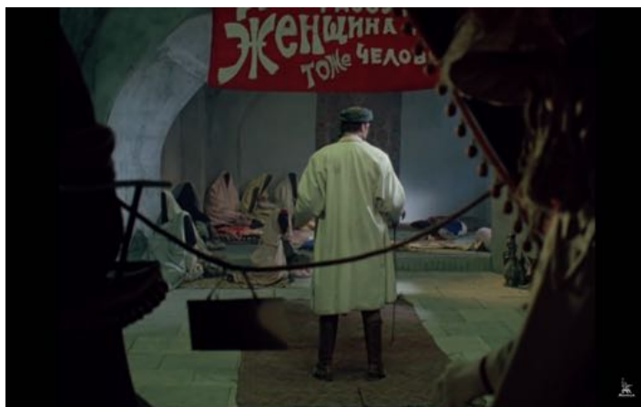
Figure 7. Still image, Белое солнце пустыни (White Sun of the Desert), Mosfilm, 1972.

and all to “animality,” in Arendt’s definition, in the name of human emancipation. By negating the reproductive function of the household, universal subjection to necessity was achieved at the unprecedented scale of an entire society. Soliciting the speech acts of “woman-nationals” in public set up the symbolic realm of the Soviet economy. Collective efforts to manage social necessity in public cafeterias, kindergartens, and laundrettes, however, were cut short by the death of Vladimir I. Lenin in 1924. In effect, women throughout the Soviet Union became burdened with a “double shift” of domestic labor and participation in the public labor force.