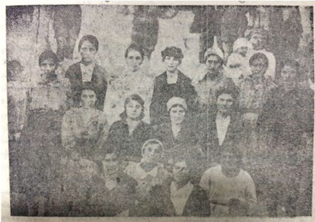
Figure 10. Photo, “Delegates’ Meeting in Ghurgughlu,” Armenia’s Woman-Worker , No. 5, 1924, 19.

The composition of the scene allegorized the Soviet scheme of women’s emancipation. It represented the court room as a sphere of engagement for newly hailed subjects. Didactically, its protagonists were drawn on different scales to center the figure of the “woman-national” as a native informant whose “enlightened” consciousness was to reshape her milieu. Soviet justice depended on her willingness to testify to her deplorable condition in court. The patriarch is merely her supportive cast. His role is to submit to Soviet authority.