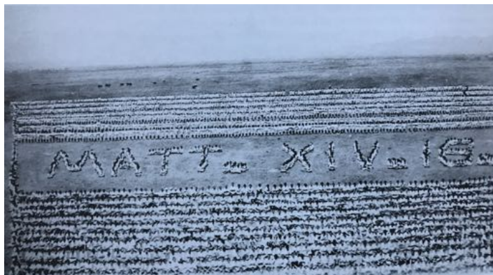
Figure 5. “Matt. XIV. 16.” formed out of the bodies of two thousand Armenian girls at the Polygon orphanage in Alexandropol, Armenia (Nercessian 2016, 142).

American staff at the Near East Relief orphanage in Alexandropol worked to reinforce these linkages through “military drills” that functioned to inscribe and showcase American order and discipline. In the vast spaces stretching between the barrack complexes, the Armenian orphans were assembled and arranged in formations that spelled out slogans and messages intended for the supporters of Near East Relief in the United States. Dressed in all white, the black hair of children whose bodies were arranged in geometrical formations appeared as a line in photographs taken from a bird’s-eye view. One such photograph showed Armenian orphans sitting in rows upon rows to form the abbreviated biblical notation “Matt. XIV. 16.” A small herd of cattle can be seen grazing in the distance. The meaning imposed by the verse spoke directly to Near East Relief’s mission of repatriation, rehabilitation, and reestablishment in the region.