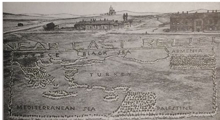
Figure 6. “Near East Relief,” map outline formed by girls of the Sversky orphanage school, title by boys from Polygon school, Alexandropol (Nercessian 2016, 141).

Not only were the little bodies disciplined and their lives put in order, but they also became a vehicle to inscribe American tutelage in the Armenian environment. In one astonishing instance, 4,200 Armenian girls formed a map of the Near East and sketched – with their bodies – the outlines of Armenia, Turkey, Palestine, Cyprus and Greece. The locations of Near East Relief orphanages appeared “crowded” with bodies while geopolitical boundaries were omitted. Outside of the enormous rectangular frame of the map, young boys formed the words “NEAR EAST RELIEF” as a title.