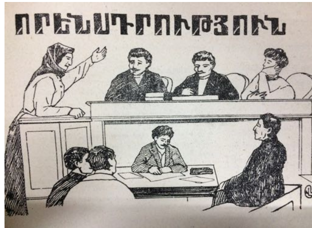
Figure 9. Illustration, “Justice,” Armenia’s Woman-Worker , No. 5, 1924, 38.

neck. However, her headscarf is lowered below her chin in order to allow her to speak freely. She is depicted on the witness stand, airing a grievance against her husband in court.