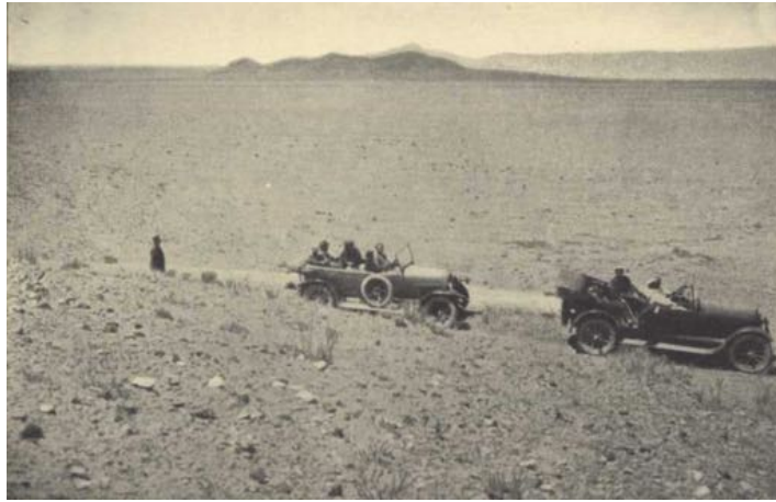
Figure 4. Fridtjof Nansen’s 1926 expedition to the Sardarabad Plain, Armenia (Nansen 1928, 136).

which the Western Powers of Europe and the United States of America had pledged themselves to give to the Armenian nation, and of which the League of Nations had repeatedly held out a prospect” (Nansen 1928, 5).