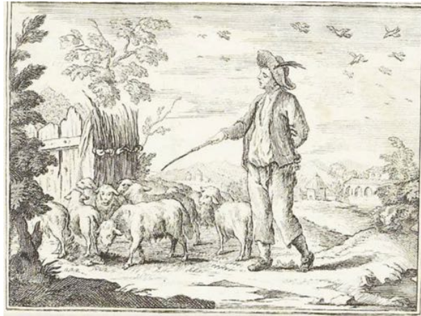
Figure 1. Frontispiece, Որոգայթ փառաց (Entrapment of Glory), Madras, 1773/1788 141

In this event, the governorship would lose its representative character. As a trade-off, however, the legitimacy of dynastic sovereignty would be absorbed by the state and pass onto parliament.