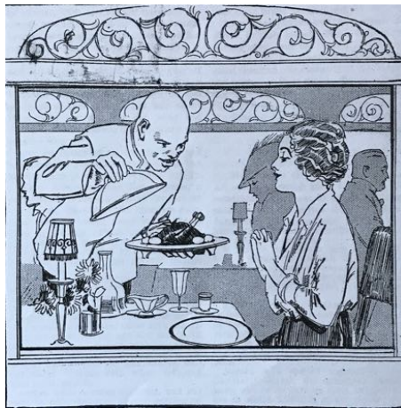
Figure 2. “Like A Story in the Fairy Books,” The Washington Times , January 5, 1919.

An article in The Washington Times juxtaposed her previous condition – crouching on the floor of a cattle car, holding a coarse chunk of bread under the watchful eyes of male guards in vaguely “Oriental” uniforms – to her “triumphal trip” to California where she was presumably “greeted like a princess.” 199 It framed her de facto abduction by her de jure guardians as a story of racial redemption.