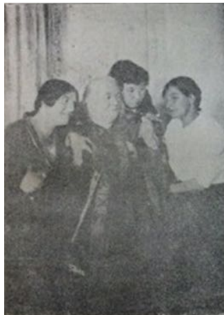
Figure 11. Photo, Clara Zetkin at the Women’s Club in Tbilisi, Armenia’s Woman-Worker , No. 3, 1924, 39.

In 1924, the Transcaucasian women’s department hosted an illustrious visitor from Germany. Clara Zetkin, a feminist supporter of Soviet emancipation campaigns, traveled through Transcaucasia and described her visit at the “Muslim Woman’s Club” in a book-length account that has been translated into Russian, but not into English. 330 Her image was taken and appeared in the first issue of Armenia’s Woman-Worker , an Armenian-language journal of the Transcaucasian women’s department.