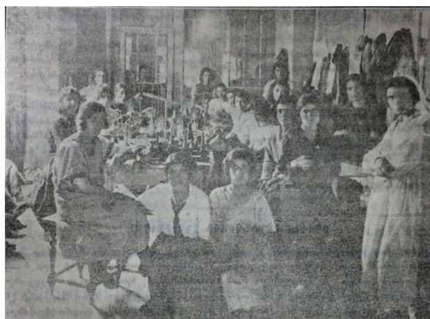
Figure 8. Photo, Armenia’s Woman-Worker , No. 4, 1924, 23. A women’s workshop in Leninakan, Armenia, consisting of twenty-four workers, producing socks since April 1923.

In Armenia, comparatively few women participated in the public labor force to begin with. Employed as teachers, nurses, and cleaners in schools, orphanages, and hospitals, rather than in factories, they were predominantly categorized as “technical” rather than industrial workers. Yet, the emancipation of woman-nationals depended on “humanizing” labor ( menschliche Arbeit ) outside of the household (Marx 2005, 98). In order to further this objective, the Transcaucasian women’s department created agricultural cooperatives and artisan workshops for women ( Артель ).