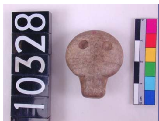
Figure 7. Limestone amulet. Badari (UC10328).