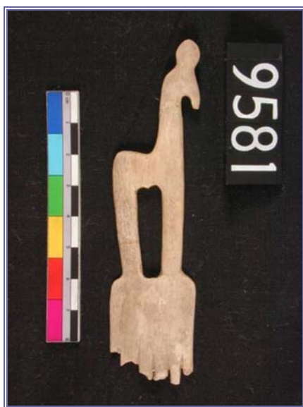
Figure 3. Fragment of ivory comb with animal ornament. Badari, Tomb 1670 (UC9581).

consensus exists as to their purpose or even their basic subject matter (Ucko 1968). Some are closely comparable in form and surface detail to figures rendered in other media, such as those modeled or painted on ceramic vessels. This fluidity of decorative forms between mobile media is strongly characteristic of Predynastic art as a whole, but frequent attempts to extend such comparisons to the extensive record of Nilotic rock art remain inconclusive and do not in themselves provide a reliable method for dating the latter (Wengrow 2006: 99 - 123).