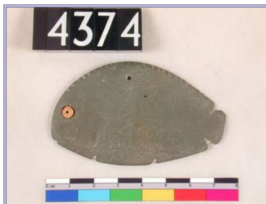
Figure 4. Fish-shaped cosmetic palette. Siltstone. Naqada, Tomb 117 (UC4374).

Another important class of free-standing object is pottery, use of which as a surface for painting underwent a number of changes during the Predynastic Period. Most striking is the shift between two monochrome traditions, from a light-on-dark to a dark-on-light format, which marks the onset of Naqada II (c.3600 BCE). The former White Cross-Lined Ware (abbreviated as “C-Ware”) is known primarily from cemeteries in Upper Egypt and Lower Nubia, dating to the early fourth millennium BCE. It features loosely symmetrical arrangements of living beings, particularly wild river-animals such as hippopotami and reptiles, occasionally