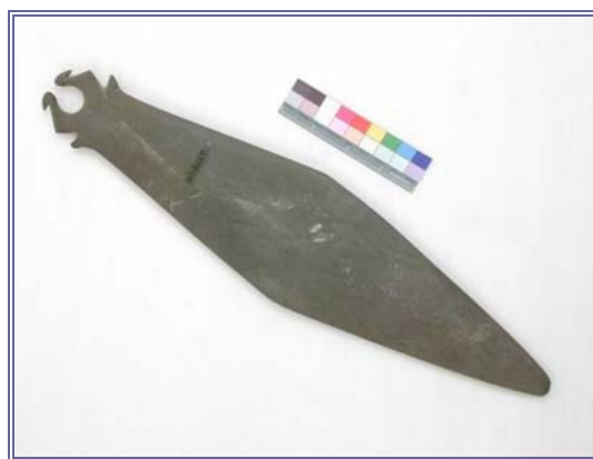
Figure 5. Cosmetic palette. Siltstone. Naqada/Ballas (UC6025).

depicted alongside figures of human hunters. Painting is executed in white on a polished red background and typically appears on open forms such as bowls (fig. 9) and beakers. By contrast, the later Decorated Ware (abbreviated as “D-Ware”) was made in a marl fabric that created a pale surface for decoration, executed with a dull red pigment. Its characteristic vessel form is a closed globular jar, probably inspired by contemporaneous stone vessels, the patterned texture of which is sometimes imitated in paint. On vessels with figural decoration, activities relating to water remain a dominant theme, notably through the inclusion of paddled boats with emblematic standards (fig. 10); but the repertory of riverside creatures has changed with the inclusion of flamingos and horned ungulates. As on earlier painted