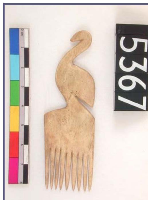
Figure 2. Ivory comb with bird ornament. Naqada, Tomb 1419 (UC5367).

humans (fig. 8) and animals, as well as examples that appear to deliberately combine elements from different species. Free-standing figurines in ivory and bone appear not to have been produced in any quantity until the very end of the Predynastic Period, which saw a proliferation of such figures that continued into the Naqada III Period and beyond. The interpretation of Predynastic figurines is an area of ongoing controversy and no