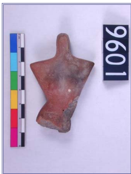
Figure 8. Fragment of anthropomorphic figurine. Fired Nile silt. Qau (UC9601).

pottery, male figures are sometimes distinguished by the penis sheaths they wear. The maximum distribution of Decorated Ware extends from Lower Nubia as far north as the southern Levant.