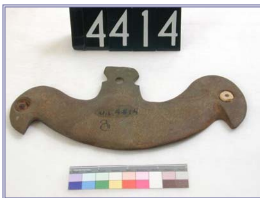
Figure 6. Cosmetic palette (“tag”) with double-bird ornament. Siltstone. Naqada, Tomb 8 (UC4414).