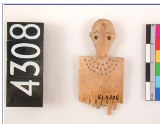
Figure 1. Fragment of ivory comb with anthropomorphic ornament. Naqada, Tomb 1411 (UC4308).

In addition to objects attached to the body, the known repertoire of Predynastic art also comprises many free-standing forms. Among the most widely discussed are clay figurines of