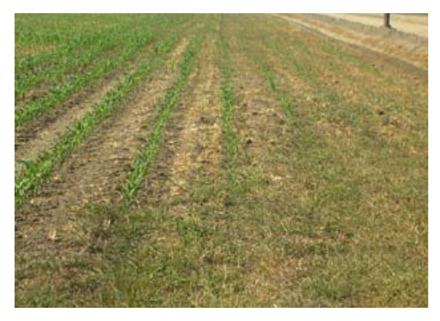
Figure 2 . Alfalfa stand loss at end of field due to standing water.