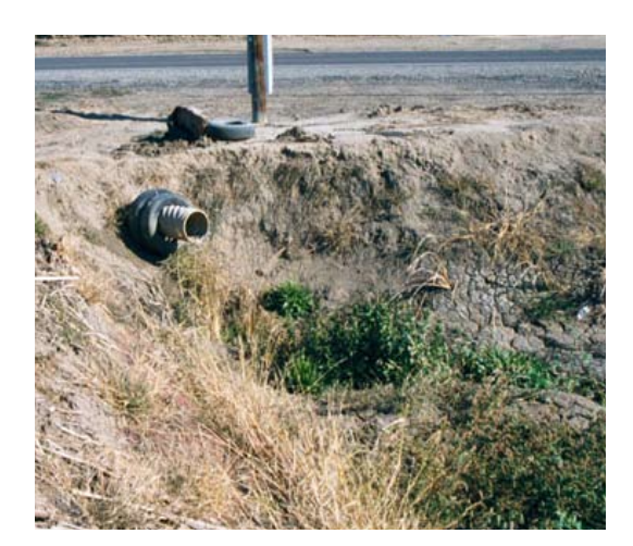
Figure 3. Cantilevered pipe discharge into tailwater pond. Photo: Lawrence J. Schwankl.

As a rule of thumb, expect the tailwater volume to be 15 to 25 percent of the water applied to an irrigation set. For example, if an irrigation set has a flow rate of 1,500 gallons per minute and is 8 hours long, the expected tailwater discharge (15% of inflow) would be 108,000 gallons (1,500 gal/min \times 60 min/hr \times 8 hr \times 0.15 = 108,000 gal). (For metric conversions, see the table at the end of this publication.) This would be 14,440 cubic feet or 0.33 acre-feet of water. A tailwater volume of 25 percent of the irrigation set applied water would be 180,000 gallons (2,060 cubic feet, or 0.55 acre-feet).