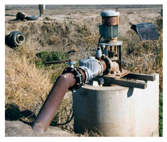
Figure 7. Control (butterfly) valve, air-vacuum relief valve, and check valve located downstream of tailwater return pump.