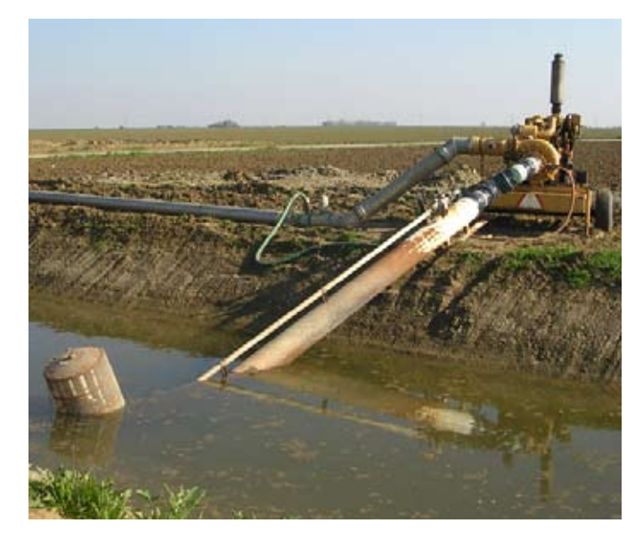
Figure 6. A rotary pump intake screen and diesel engine used for tailwater return.