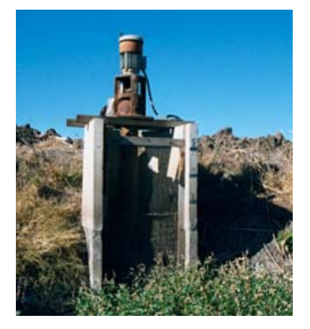
Figure 5. Trash screen on a concrete sump intake box.