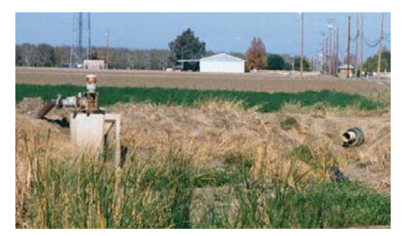
Figure 1. Tailwater collection system.