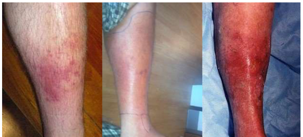
Fig 2. From left to right: Mild, moderate, and severe cellulitis.

The questionnaire was developed through consultation with a panel of experts and drew on existing surveys such as the Unlinked Anonymous Monitoring (UAM) Survey, a National surveillance study with PWID conducted annually [17]. Question domains comprised: socio-demographics; drug use history, injection preparation and administration practices (lifetime and previous 12 months); reuse and cleaning of injecting equipment (lifetime); experience of SSTI and other health conditions and care seeking practices (lifetime). Questions pertaining to SSTI experience were accompanied by pictures of abscesses and/or cellulitis at different stages (Figs 1 and 2). Still-based images are a reliable method for the assessment of wounds, their type and severity [19], with evidence that photographs can illicit clinical evaluations equivalent to those conducted in person [20]. Participants were shown SSTI photographs along with a