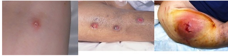
Fig 1. From left to right: Mild, moderate, and severe abscess.

https://doi.org/10.1371/journal.pone.0235350.g001