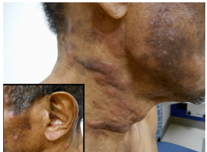
Figure 1. Erythematous, indurated papules and plaques involving the lateral neck, face, and ears (inset). Note hyperpigmented patches corresponding to burnt-out lesions.

A 77-year-old man with a history of seropositive rheumatoid arthritis (RA), presented to our clinic with a rash of 15 months duration involving the scalp, face, neck, and upper chest. The patient endorsed lesional pruritus and burning but denied photosensitivity. The rash was episodic in nature, with periodic exacerbations followed by partial spontaneous resolution of lesions. There was no history of prior treatment. He reported a flare of his RA with left wrist swelling and pain around the time of initial presentation. Additional comorbid diseases included chronic obstructive pulmonary disease, a previous history of alcohol abuse, and a ten-year history of stable anemia and leukopenia