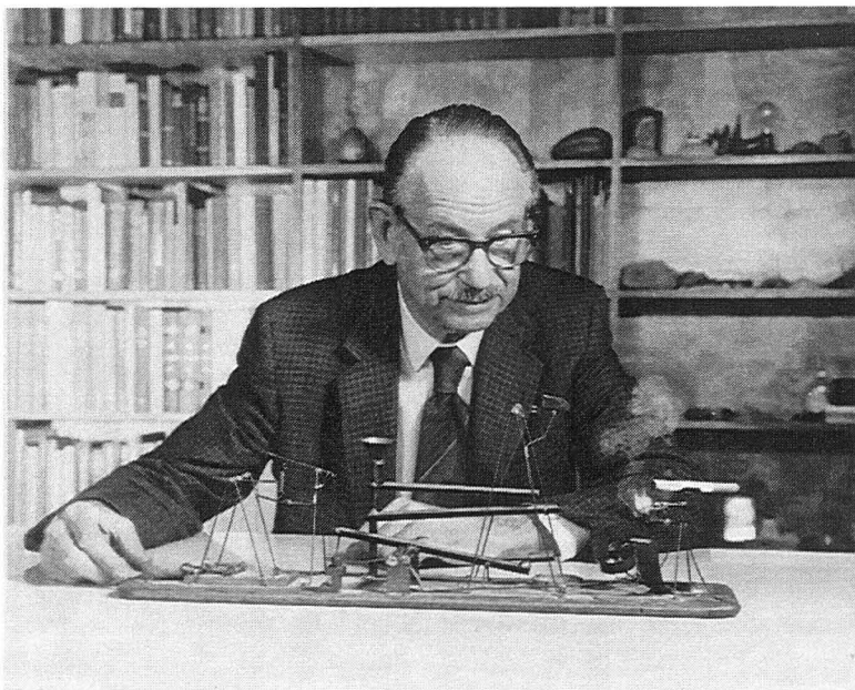
Figure 2. Ed. McMillan contemplates "AJAX, combination atom smasher and cigarette lighter" ca. 1970.

Edwin McMillan is remembered as a great man by the people who knew him. He had a range of knowledge and curiosity that can only be described by saying that he was a natural scientist. He contributed to many fields of science in addition to physics and chemistry: mathematics, biology and medicine, and astrophysics. His quiet sense of humor and appreciation of the absurd lay just below his serious surface (Figure 2). His demeanor was relaxed, but in matters of principle firm.