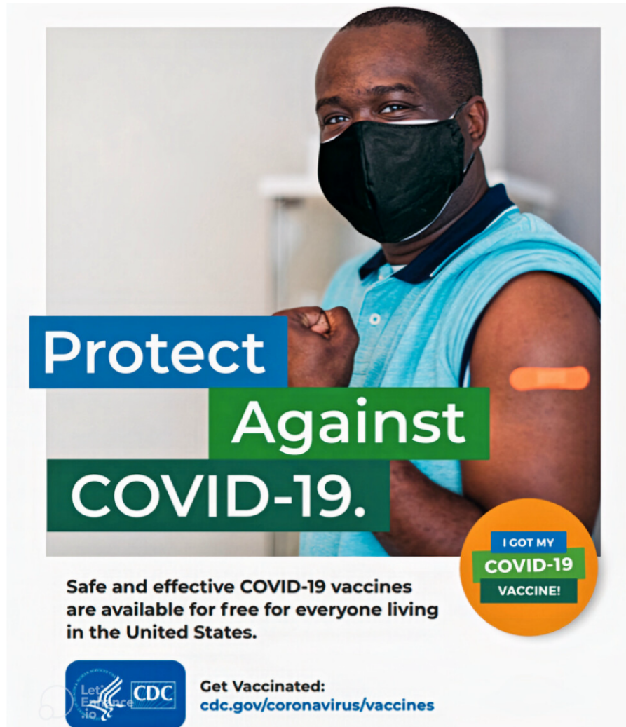
Figure 2. Centers for Disease Control and Prevention (CDC) messaging highlighting the care and fairness moral foundations.

This paper examined whether moral foundations were related to incivility surrounding COVID-19 vaccine discourse. We found that purity, fairness, harm, and in-group loyalty were positively related to different dimensions of incivility. This study adds to the growing literature focused on theorizing the mechanisms behind incivility related to COVID-19–related discourse. Our findings highlight the need for health campaigns to design messages appealing to specific moral foundations of specific demographics. For example, organizations such as the CDC have already created messaging that highlights moral foundations such as care and fairness by highlighting the protective nature of vaccines and their availability for all individuals (see Figure 2 for details). By integrating moral foundations, messaging related to COVID-19 may be an effective way to persuade audiences to follow public health protocols and engage in civil discourse.