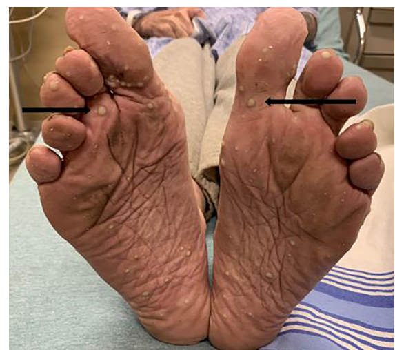
Image 2. Patient's feet with black arrows pointing to pustules on the soles consistent with palmoplantar pustulosis.

usually develops in middle-aged adults, 50-69, and occurs more often in females. 3 While the pathogenesis is unknown, studies have suggested an inflammatory process that destroys