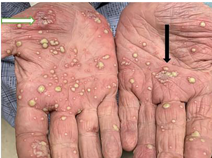
Image 1. Patient's palms with black arrow pointing to coalescing pustules with surrounding erythema and white arrow pointing to pustules with scaling consistent with palmoplantar pustulosis.

Palmoplantar pustulosis is an uncommon skin disorder with a presumed prevalence of less than 1% of the population. 2 It is characterized by recurrent eruptions of sterile pustules primarily localized to the palms and/or soles. 2 Some consider PPP to be a subtype of psoriasis, but others suggest it is a separate entity. 5 It is thought that PPP