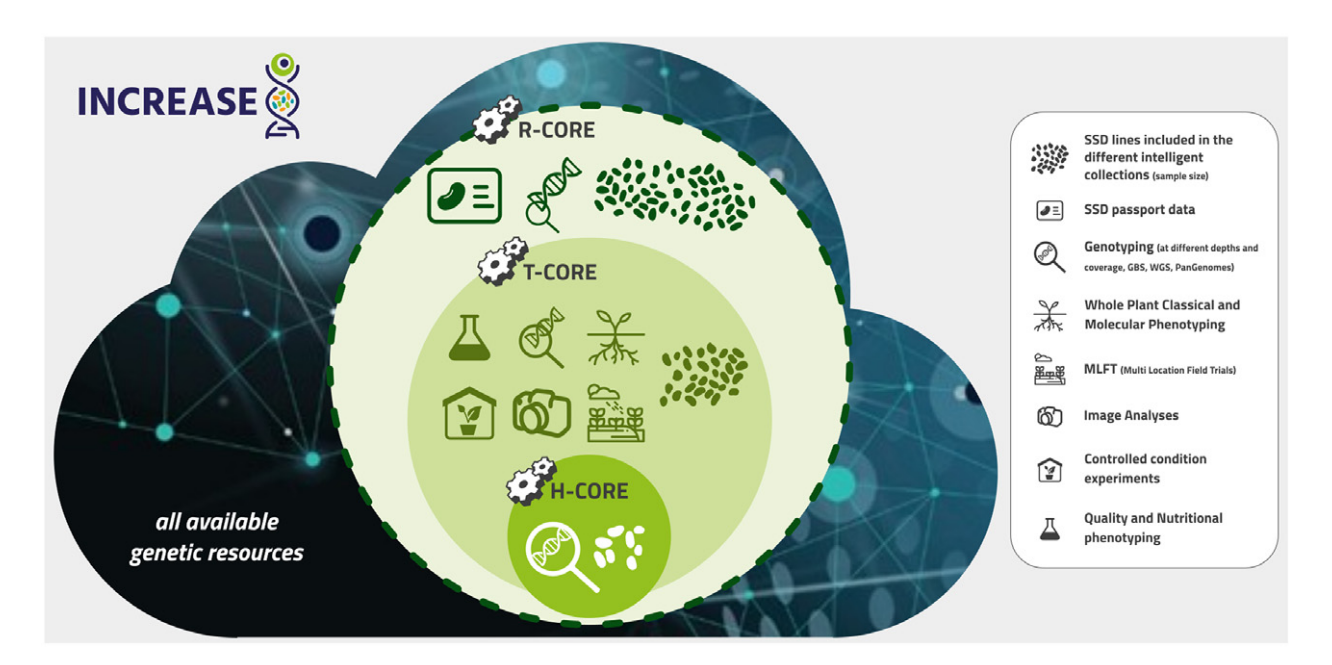
Figure 2. Schematic summary of INCREASE Intelligent Collections (ICs): Reference-CORE (R-CORE), Training-CORE (T-CORE) and Hyper-CORE (H-CORE) developed in INCREASE and activities that will be carried out on the different panels. Starting from all the available genetic resources for each of the four INCREASE legume species. R-CORE will be constituted of thousands of single-seed descent (SSD) lines, representative of the genetic resources of the species, with as complete and informative as possible passport data, and R-CORE will undergo low-coverage genotyping; T-CORE will be constituted of a subset of R-CORE (few hundreds of SSD lines) which will be involved in several phenotypic (including transcriptomic and metabolomic) and genomic characterizations (whole genome sequencing [WGS]); H-CORE, the smallest sample (about 40-50 SSD lines, based on an evolutionary transect) will be in-depth genotyped and phenotyped. All the genotypic data and information and related genomic predictions coming from the characterization of the ICs and of sub-cores of nested core collections will be the link between phenotypically evaluated and non-evaluated accessions from the universe of all available genetic resources (as far as genotyping data are available).

lines, domesticated lines not adapted to European environments and CWRs, which will be used mostly for controlled condition experiments. Thus, T-CORE phenotyping will be based on different sub-samples based on the type of experiment and the level of complexity of phenotyping (e.g., intercropping experiment using common bean and maize [Zea mays], droughtcontrolled condition experiment for chickpea and common bean, etc.);