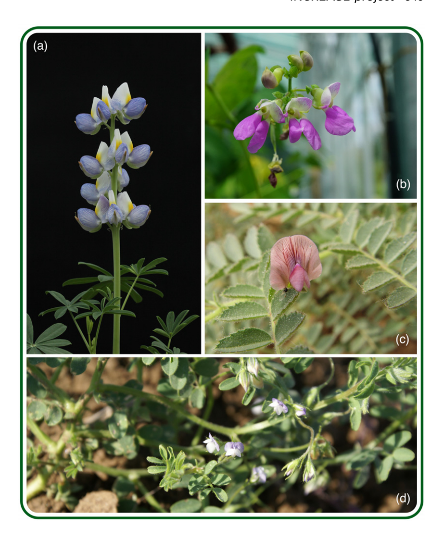
Figure 1. Flowers of the four INCREASE legume species. (a) Lupin (Lupinus mutabilis Sweet). (b) Common bean (Phaseolus vulgaris L.). (c) Chickpea (Cicer arietinum L.). (d) Lentil (Lens culinaris Medik.).

heterogeneous, which impedes the projection of the phenotypic information to the genotype and vice versa; moreover, if available, single-nucleotide polymorphism data are mapped to a single reference genome, which exclude variants present only in a subset of accessions, without the possibility to access structural variations and to obtain a complete picture of the functional genetic variation (Richard et al., 2021);