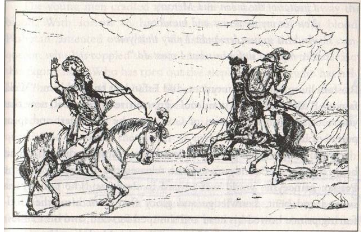
Rostam kills Esfandiyar in combat.

Goshtasp wept for Esfandiyar and proclaimed that he would never have an equal. 96 However, knowing Goshtasp's true intentions, the Persian nobles were angered: "Accursed king, to keep your throne and crown you sent Esfandiyar to