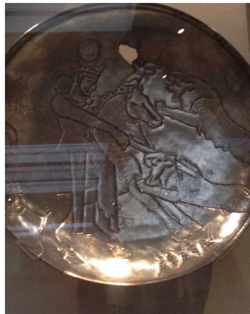
A silver plate showing a Sasanian lion hunt, popularly interpreted to be of Bahram V who was known for his hunting exploits.

Bahram is portrayed as a leader constantly learning and Ferdowsi carefully traced the transformation of a restless youth and prideful warrior to a king endowed with the farr and determined not to repeat the mistakes and injustices of his father, Yazdegerd I. Nonetheless, Bahram had many flaws, such as a weakness for wine and women, possibly what Ibn Khaldun means by Bahram’s “indifference.” His chief priest Ruzbeh, or the mobedh , complained of Bahram’s expansive harem and the financial drain it causes: “the chief eunuch has counted nine hundred and thirty nobly born women in his harem,” adding,