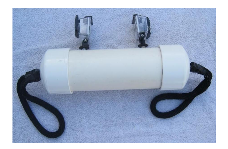
Figure 2. Cooperative problem-solving apparatus.

The problem-solving apparatus was a 43 cm long PVC pipe sealed on both ends with a cap, one of which was removable (see Figure 2). From each cap, a loop of soft, black rope protruded to allow the dolphins to grip the caps of the apparatus and pull them to open the device. The inside contained herring or capelin fish and ice as the food reward for opening the apparatus. Two GoPro Hero3 cameras were fitted to the apparatus. One GoPro Hero5 underwater and a Sony camcorder above water were used to record the sessions for coding purposes.