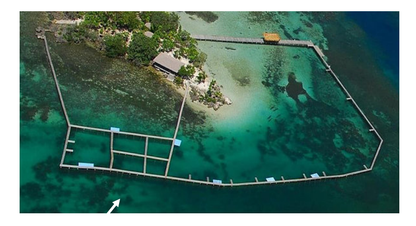
Figure 1. An aerial view of Bailey's Key. Arrow points to testing enclosures.<sup>1</sup>