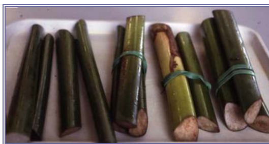
Figure 3. Cut papyrus stems ready for preparation.