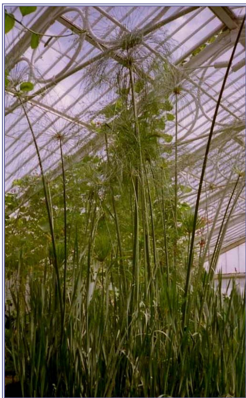
Figure 2. The papyrus plant today growing in the Royal Botanic Gardens Kew in London.