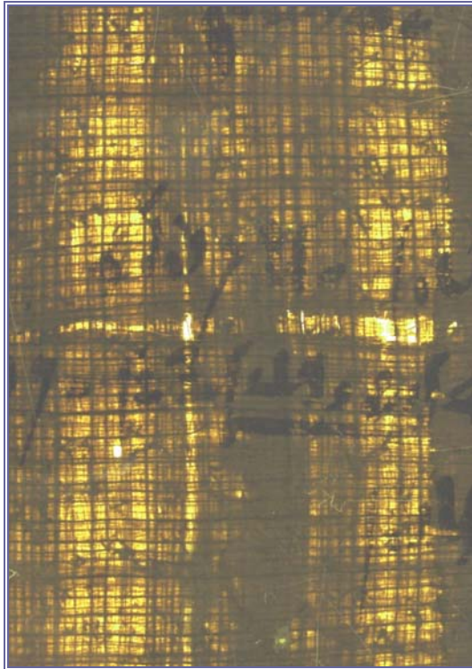
Figure 5. A section of an ancient papyrus of the Late Period seen by transmitted light, showing the structure of the writing material with the fibers forming a crisscross pattern.

certainly a valued material as the number of palimpsests from Dynastic Egypt shows (Camino 1986). Papyrus (especially the sturdy rind or epiderm) was also used to make rope, sandals, and other everyday objects.