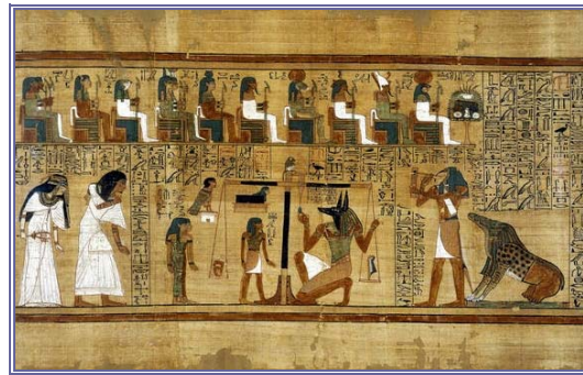
Figure 1. A section of the illustrated Book of the Dead of Any from the 19 th Dynasty. EA 10470/3.

central and east Africa and parts of the Mediterranean, including Sicily (Täckholm and Drar 1950).