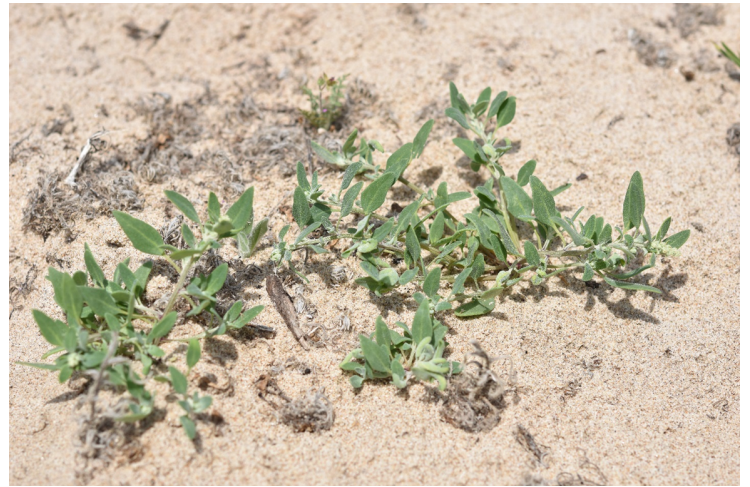
Chenopodium littoreum growing in the back dunes at COPR.

This perennial plant grows in sandy soils in back dune habitats. Until recently, all the known surviving populations occurred north of Point Conception primarily in back dune habitats. These habitats are primarily associated with the large dune complexes at Vandenberg Air Force Base and Oceano Dunes but there are also some areas where coastal goosefoot was found near the dunes around Morro Bay.