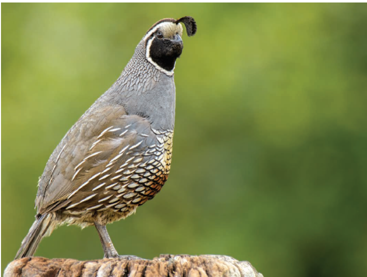
California Quail now thrive at COPR after being re-introduced in 2007.

Days on the beach seem to be in balance, although the outside world feels far from even-keeled. The tiny Snowy Plover chicks run among the sand and kelp, a docent chats with a beach-goer, who then thanks the docent for pointing out the chick and moves closer to the ocean edge. This coexistence is possible and necessary for all of us. The Snowy Plovers need their beach or they will go extinct. But do we need the Snowy Plovers? I believe we do. When we are in nature, with nature, we are at our best. Watching and communing with the plants and animals here gives us a sense of belonging to something larger than our 2020 troubles. We feel that we are part of it all, this intricate web of ecology and belonging. Although our urban lives may distance ourselves from the complex beauty of the natural world, the moving dunes, the wild scrubland, and the treasure-filled coastal intertidal are here, for us, if we wish to visit and remind ourselves of the wild world outside we are fortunate to live in.