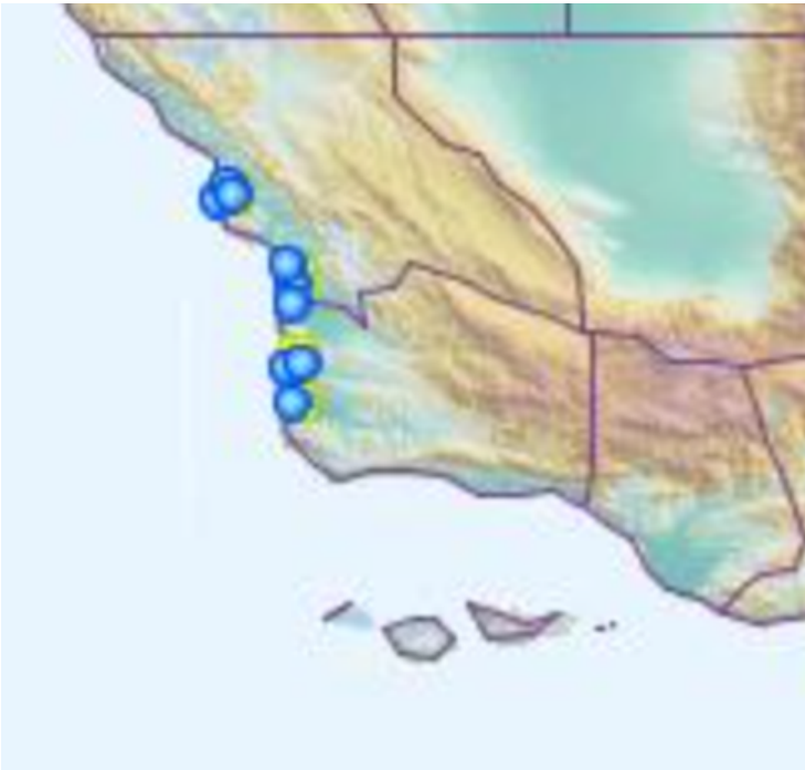
Chenopodium littoreum range map

Coastal goosefoot, Chenopodium littoreum , is a small annual plant in the family Chenopodiaceae. This family, known as the Goosefoot family, also contains spinach and quinoa. Coastal goosefoot is a California endemic that only occurs on the central coast. It is listed as a 1B.2 plant in the California Native Plant Society Rare Plant inventory, meaning that it is rare, threatened, or endangered in California.