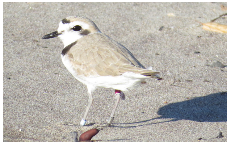
This visiting plover came to COPR all the way from Baja CA, Mexico. The plover was identified by his red flag band.