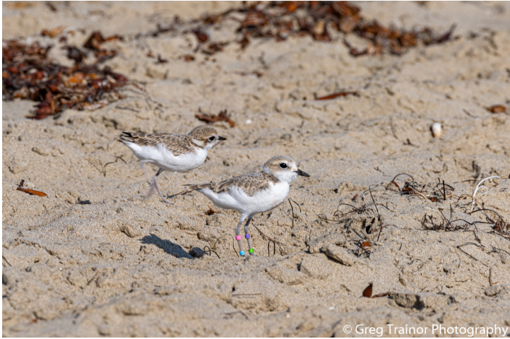
Plovers on their release day at Sands Beach.

While 2020 certainly had its obstacles, the reserve's Snowy Plovers and docents alike were up to the challenge. Our staff and docents adopted new protocols to stay safe in light of COVID-19 and had the rewarding task of running a full-on plover nursery!