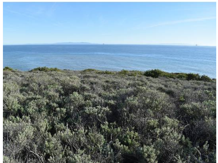
The results of the restoration of California coastal scrub habitat at COPR.