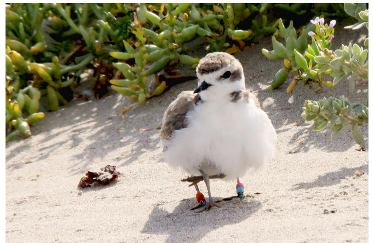
Banded plover "pa:or" broods a chick on Sands Beach. This adult plover originally came from an egg rescued from high tide in 2019, raised at SB Zoo, and released back at COPR.

These were my experiences at Sands Beach. I've been to COPR hundreds of times. The beautiful thing is that each time is a different experience.