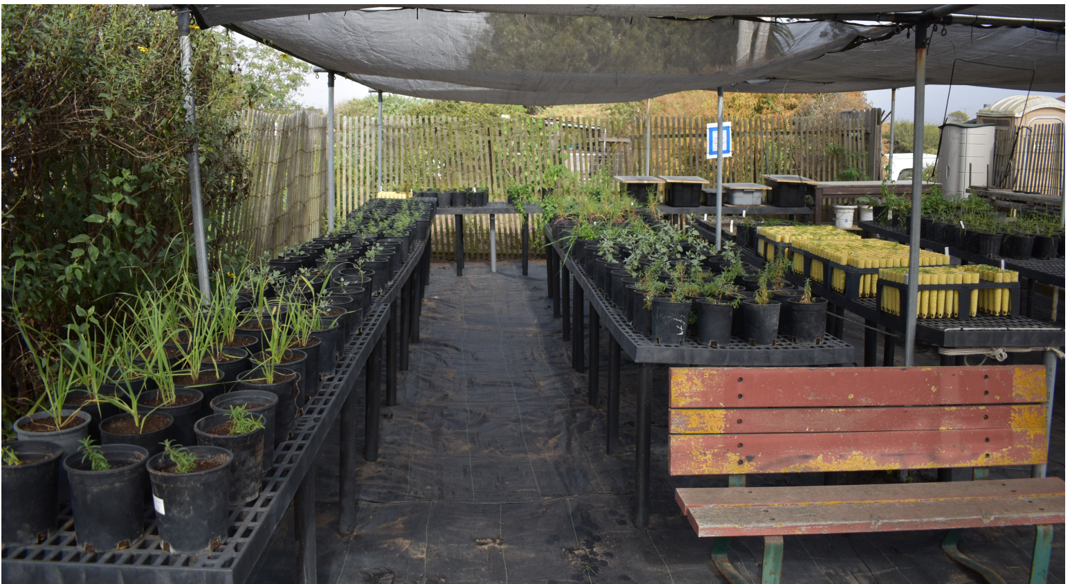
Native plants are cared for in the shadehouse prior to being planted at habitat restoration sites at Coal Oil Point Reserve.

To Become Involved in This Project, Contact Kipp Callahan copr.steward@nrs.ucsb.edu