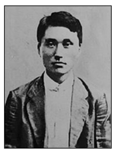
Figure 3. Yi Kwangsu in Tokyo, 1918.