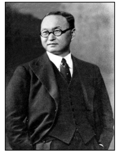
Figure 2. Chang Tŏksu later in life.