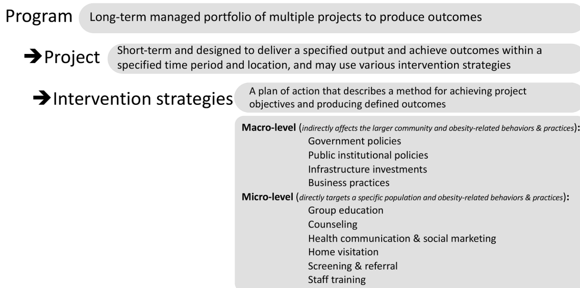
Fig. 1. Early Childhood Obesity Systems Science Study (ECOSyS) intervention database classification of interventions addressing obesity.

To estimate the effect of dose of obesity-related interventions on early childhood obesity prevalence, we ran Ordinary Least Squares models with fixed-effects regressing early childhood obesity prevalence on annual intervention strategy count received in the preceding year ( time_{t-1} ). We conducted our analyses sequentially, first constructing an unadjusted model and then adjusting for the following ZIP Code-level time-variant variables: poverty, education, and minority composition (% non-Hispanic Black or Hispanic), and obesity prevalence of the preceding year ( time_{t-1} ). We also included a dummy variable for 2008 and 2009 to take into account the 2008–2009 Great Recession (Morin, 2010) and the 2009 WIC food package change (Food and Nutrition Service (USDA), no date), both of which have been shown to be associated with trends in childhood obesity prevalence rates in the LAC WIC population