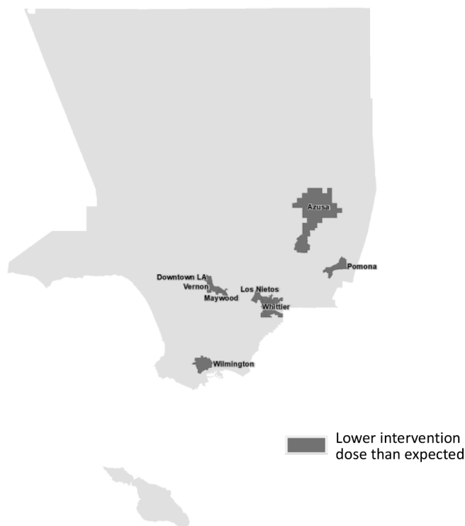
Fig. 3. Neighborhoods that received a lower intervention dose than expected based on neighborhood levels of obesity and sociodemographic characteristics in Los Angeles County between 2005 and 2015. Neighborhoods were identified by comparing neighborhoods' observed intervention dose with its predicted intervention dose based on neighborhood level of obesity prevalence and sociodemographic characteristics and the model: InterventionDose = \beta_0 + \beta_1 ObesityPrevalence + \beta_2 Poverty + \beta_3 Education + \beta_4 Minority .

We found evidence that interventions implemented in LAC during 2005 to 2015 were directed toward vulnerable communities. Specifically, ZIP Codes with higher obesity prevalence and those with poor socioeconomic profiles tended to receive more intervention strategies. Our findings suggest that rates of poverty and the concentration of racial/ethnic minority residents have influenced the distribution of funds for obesity prevention in LAC, and that both macro- and micro-level interventions (see Appendix A for examples) supported by large-scale initiatives designed to promote child well-being in LAC have had an impact on childhood obesity.