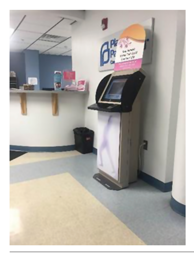
Fig. 4 | Women's stories health kiosk in planned parenthood clinic waiting room