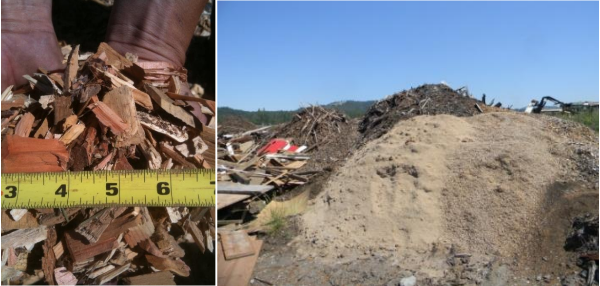
Figure 3. Wood waste used in the TSY-Peak biochar system. Left is the hog fuel used to power the gasifier. Right is the waste biomass currently left to rot in the log yard, which feeds the pyrolytic retort.