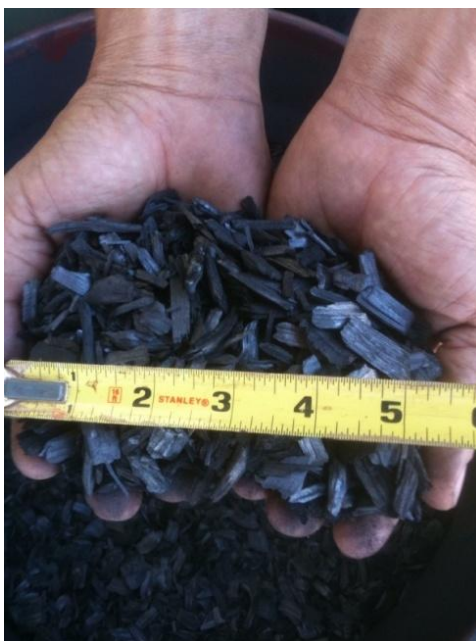
Figure 5. Biochar product produced by the TSY-Peak system.

The operators of the TSY-Peak project plan to sell the biochar to research universities, to apply the char to portions of their own forests 15 to 50 miles away, and to sell the biochar for other horticultural applications.