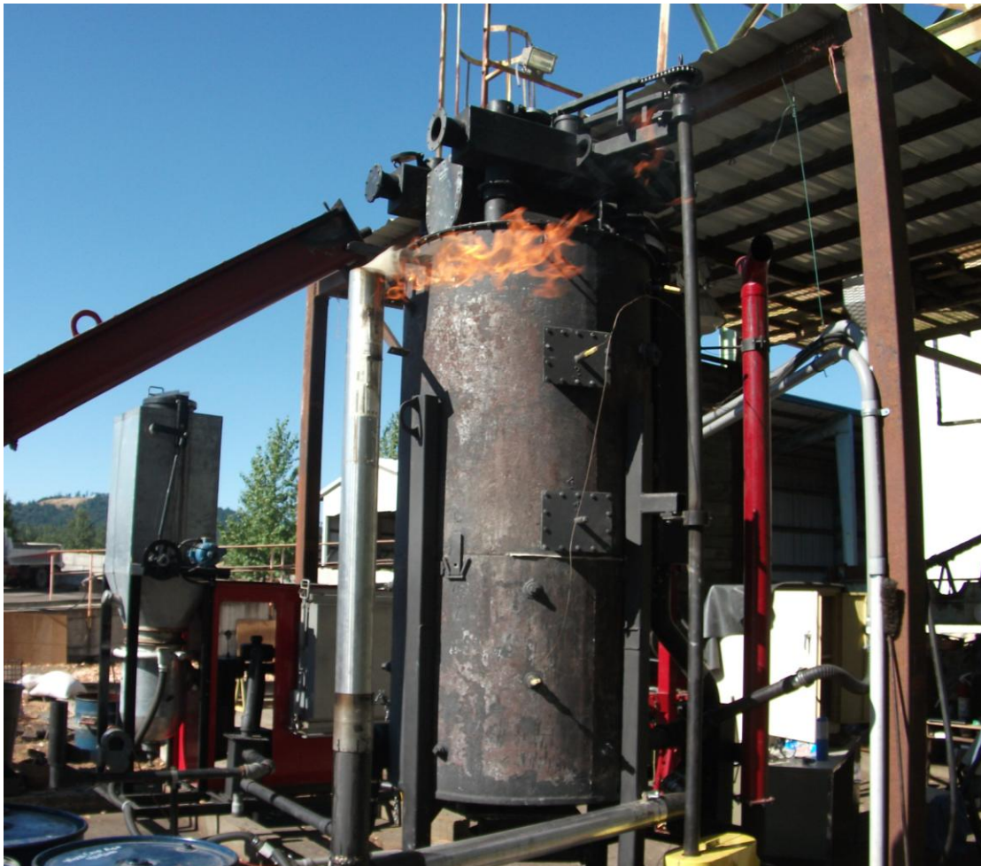
Figure 2. Fluidyne Gasifier (left background, metallic surface) and pyrolytic retort (right front, black paint) in the log-sorting yard of Thompson Timber/Starker Forest, Philomath OR.

A Fluidyne Pacific Class down-draft gasifier provides thermal drive for the entire system. The gasifier utilizes a small portion of the oversized wood chips that are screened out during the chipper plants' sorting process. These chips are air dried to 15% moisture. Wood chips are thermally reduced in a high temperature, low oxygen environment, to yield a relatively low heat value combustible gas known as producer gas. At approximately 164 BTU per standard cubic foot, producer gas by volume has around one-seventh the heat energy of natural gas. However using this pathway the thermal requirements of the pyrolytic retort can be achieved with low value biomass. The gas is ignited and then used to heat the pyrolytic retort.