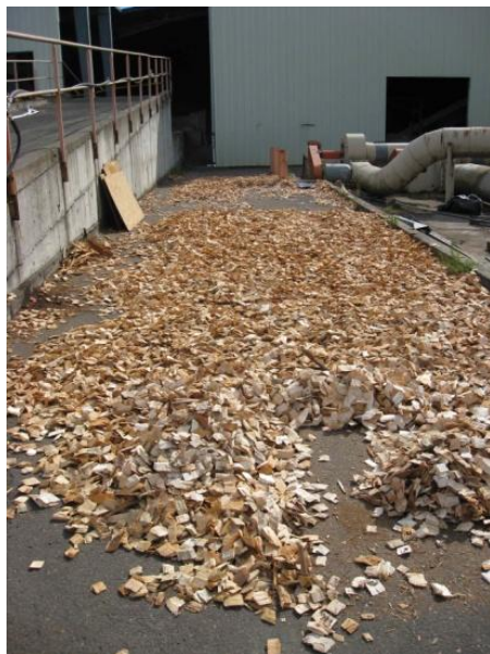
Figure 4. Air-dried hog fuel used in the TSY-Peak biochar system

Oversized wood chips that are dried to 15% moisture content are loaded into the top of the gasifier. A small bed of charcoal is placed at the bottom of the gasifier manifold. The gasifier is started by turning on the blowing motor which forces air over the charcoal bed. The draft mechanism draws a sub-stoichiometric amount of ambient air across the hearth of charcoal which is then lighted by a propane torch. This results in a high temperature oxidation zone with a lower temperature (about 850° C) anoxic reduction zone just below. Combustible producer gas, the outcome of this gasification process, is fed through a high temperature flexible hose (approximately 2 inches in diameter) to a burner inserted in the base of the PR. The resulting ~ 1200° C flame and combustion gases circulate around the outside of the inner PR tube.