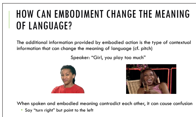
FIGURE 2. Example from a lesson using GIFs of Black women to demonstrate embodiment.

language and culture in each week's lessons. This included structural features of Black English and the use of popular Black expressions and interactional styles as well as data drawn from Black film and television characters, music, social media personae and posts (e.g. memes, GIFs), and students' personal interests. For example, the second unit of the course, discourse and embodiment, used reaction GIFs with Black actors and celebrities to illustrate different types of embodiment and the role it plays in interpreting ambiguous language such as Girl, you play too much —an example that also includes Black English features (Figure 2). 5