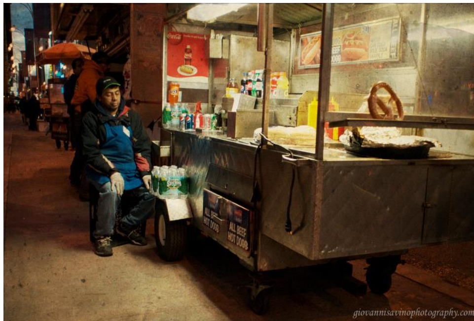
Fig. 10. Times Square, New York City.