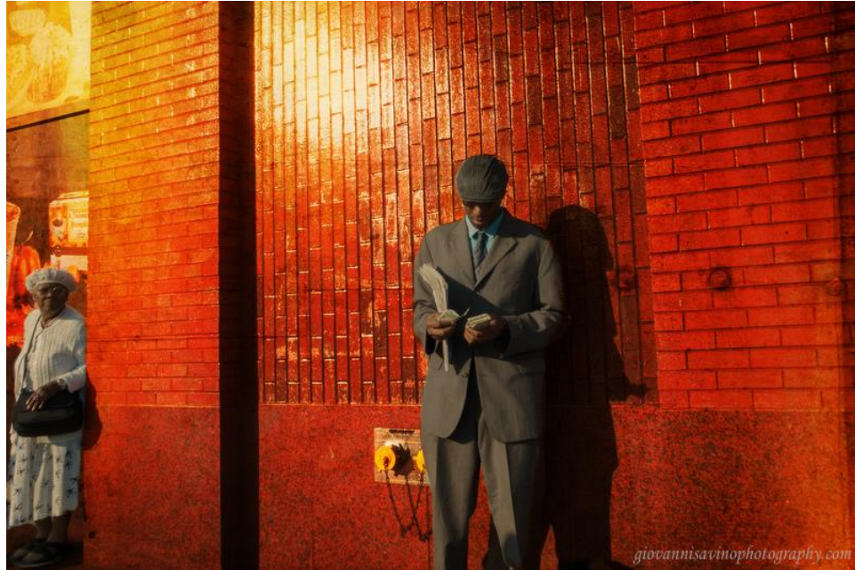
Fig. 9. Harlem, New York City.