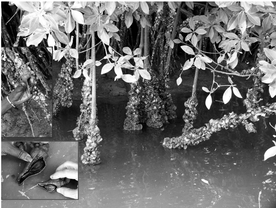
Figure 2. Wild oysters ( Crassostrea gasar ) on Rhizophora mangrove roots at low tide. Insets: whelks ( Pugilina morio ) are also collected from this habitat.

In a report on the Gambian shellfishery, Niang (2009) provided an estimate of the relative proportion of each species in the shellfish take. Subsistence harvests typically included whelk ( Pugilina morio ) (left side, Figure 2), cockle ( S. senilis ) (Figure 3), oysters ( C. gasar ) (Figure 2), sea snail ( Cymbium senegalensis ) (right side, Figure 4), and rock snail ( H. duplex ) (left side, Figure 4). Whelk constituted nearly