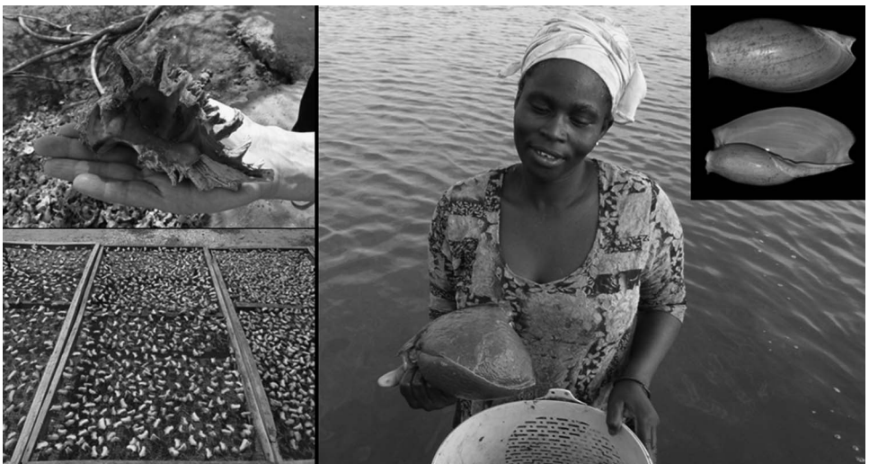
Figure 4. Left: the rock snail Hexaplex duplex (above), with drying meats (below). Right: the sea snail, yeet ( Cymbium senegalensis ), emerges from its shell after collection.