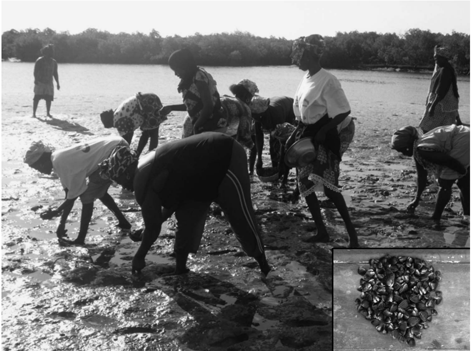
Figure 3. Cockle ( Senilia senilis ) harvesting on mudflats during low tide. Inset: pile of cockles after harvesting and waiting to be steamed for family consumption or sale.