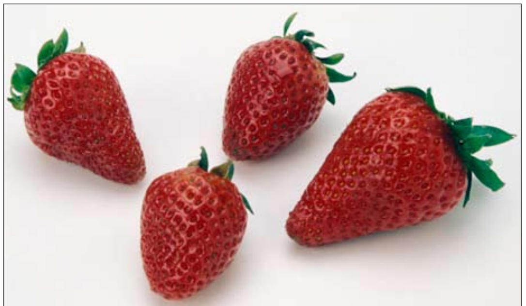
Figure 1. Photo of ripe strawberries.

The most common commercial varieties in California are the Camarosa, Diamonte, Chandler, and Selva. Proprietary and other varieties, representing about 32 percent of acreage, are bred and grown for individual shipping companies, and are not available to the public.