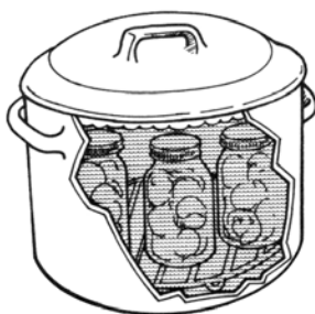
Figure 5. Boiling water bath canner and jars.

Any large covered kettle or pot may be used as a boiling water bath canner, if it is deep enough to allow water to cover the tops of the jars by 1 to 2 inches (fig. 5). Fill the canner half full with water. Preheat the water to 140°F (60°C). Place jars on a rack in the canner (fig. 5); any jars that come in direct contact with the bottom of the canner may break. Add enough boiling water to cover the tops of the jars by at least 1 inch. When water comes to a boil, begin to count the processing time indicated in table 2. At the end of the recommended processing time, remove jars from the canner and cool them, undisturbed, at room temperature. Avoid placing jars directly on cold surfaces like tile countertops because that may cause jars to crack. Setting the jars on a towel over the countertop rather than directly on the countertop can help protect jars from breaking. After the jars have cooled, check them for a tight seal. In a tight seal the metal lid will have snapped down and is curved slightly inwards. Press down on the center of the lid. If it springs back, there is no seal—either place this jar in the refrigerator or freezer, or reprocess the contents using a new jar and lid. Remove the rings of the sealed jars and wash the jars gently before storage to remove any stickiness. Washing also removes any excess jam on the jars that may attract insects during storage. Store in a dark, dry, cool place.