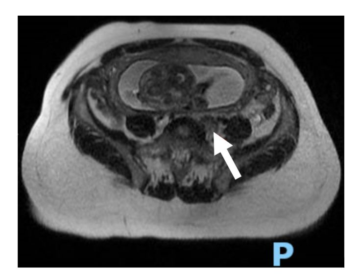
Image 3. Magnetic resonance venogram image of the left external iliac vein demonstrating a deep vein thrombosis (white arrow).

Despite negative results with three-point compression testing, circumferential leg swelling in this patient's case prompted color and spectral Doppler assessments for a proximal, iliocaval thrombus. These studies ultimately demonstrated turbulent flow patterns and decreased respiratory phasicity (Images 1 and 2). If there is evidence of a proximal venous obstruction on ultrasound imaging, computed tomography and MRV have been established as the imaging modalities of choice due to limitations of duplex ultrasonography above the inguinal plane. <sup>19,20</sup> In this patient's case, magnetic resonance imaging was obtained and identified a DVT within the left external iliac vein (Image 3). Overall, this case highlights the importance of investigations