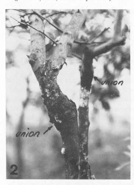
FIGURE 2. Orlando tangelo sprout, left, and Rangpur lime, right, showing the different rates of growth.

shine tangelo, Ward's sweet lime, Columbia sweet lime, Kusaie lime, Butwal sweet lime, Nocatee tangelo, and Rangpur lime. Among the cachexia-positive trees the order was similar except that Kusaie lime fell fifth to last place.