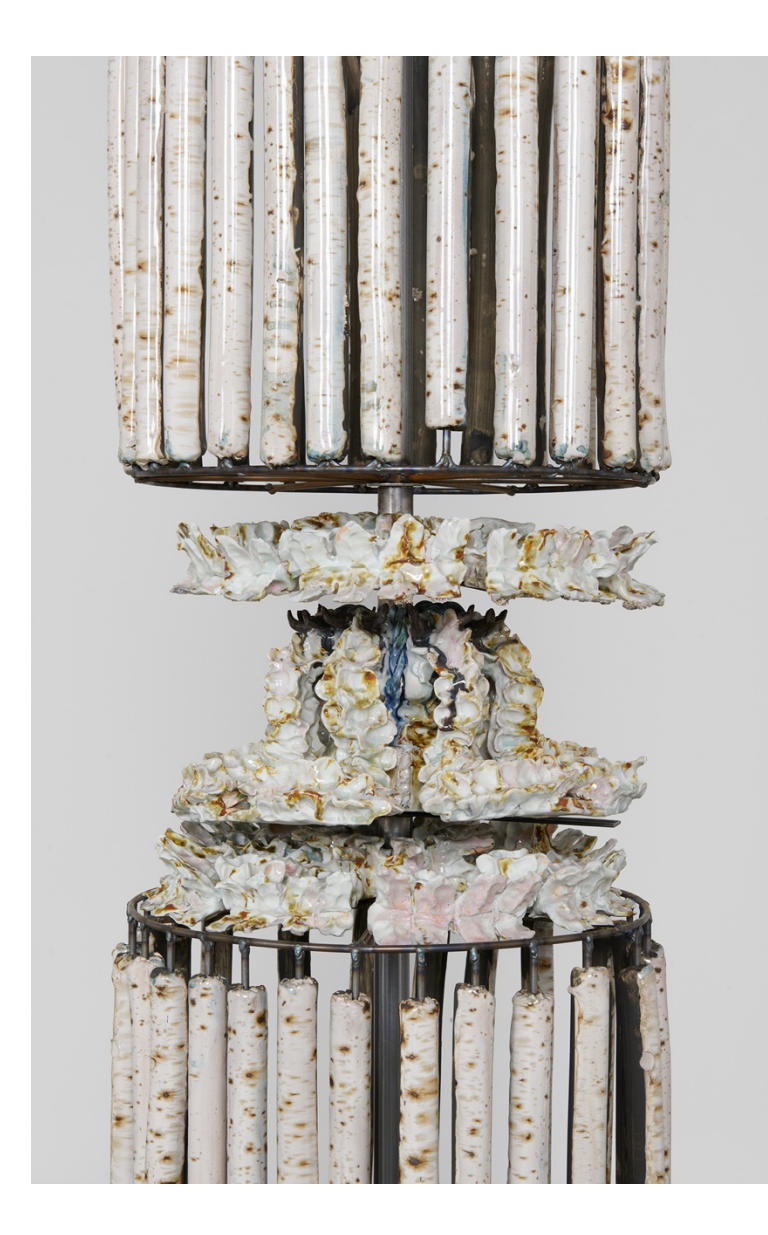
Fig.22 Showing #6(detail), 2024

Horror Vacui directly translates as a fear of the void or fear of empty spaces. Aristotle first proposed that "nature abhors an empty space," and ultimately, nature infinitely bisects to create something smaller to avoid the void. This term was an art style during the fall of the Roman Empire that prioritized visual complexity and abundance; the composition usually Lacked an obvious narrative but did create priority due to scale; all components existed simultaneously at once on the surface. Other examples of this art style exist in the Book of Kells. This illuminated manuscript elevated nature to the spiritual status of the divine but provides an overwhelming amount of mark-making and content.