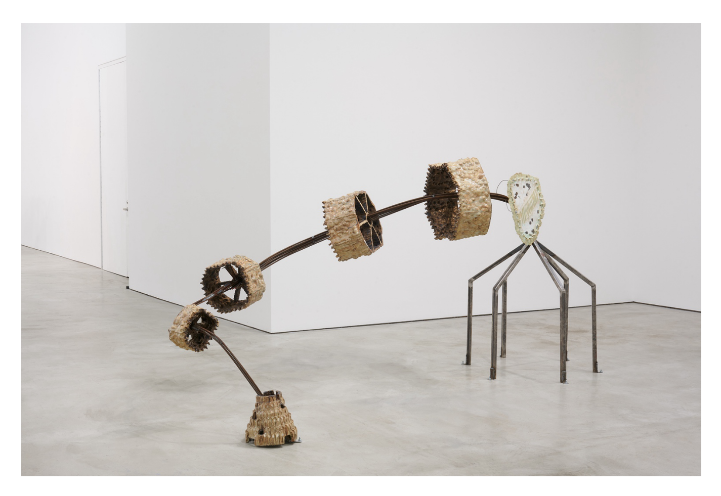
Fig.16 Showing #2, 2024, ceramic and steel

with an emphasis in microbiology I find myself continuing to choose to flood my vision and free-time in biomedical, biochemical, and microscopy research usually with an emphasis in the non-human. However, when one has been imbued with this knowledge throughout their education and transitioning into the 3-D realm of creative production, how could this science aesthetic not be embodied in a making process?