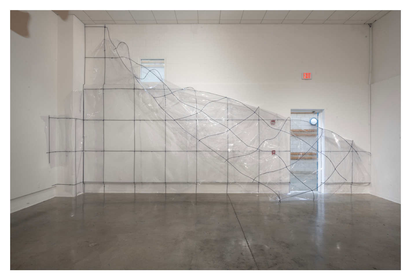
Fig.9 Pellucid, 2023, steel, vinyl, polyurethane vinyl. Shown at The Room Gallery, UCI.