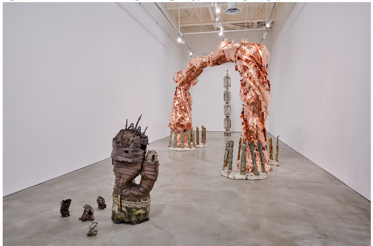
Fig.2 Installation Shot of The Showings (Showing #4(left), Showing #5(middle, copper), Showing #6 (center, column))