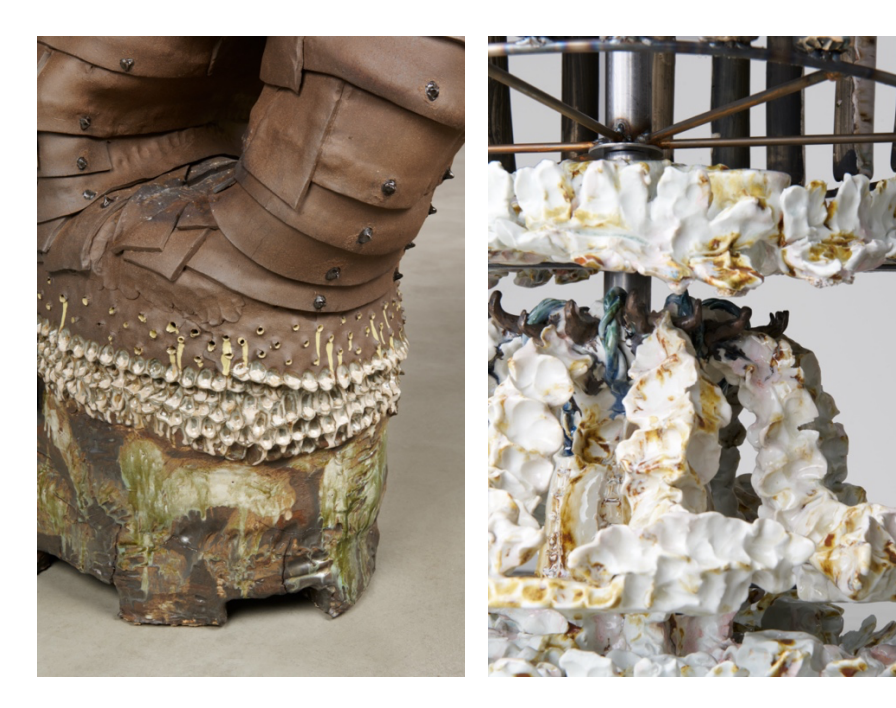
Fig.17 Showing #4(detail), 2024.

Sketching is an interactive process in which an initial idea is developed through the mark, or in my case, the gesture. These marks gain an expressive vitality that makes every element seem alive and evolving. Materials such as ceramics and steel offer immediacy and capture gestural energy through their malleability. Both allow for the immediacy of the gesture to be recorded fluidly and quickly. Both are relatively plastic processes that undergo the same level of chemical transformation: a super-heating that then crystallizes into something transformed. Literalizing some of the chemical relationships I aim to highlight, but also an irreverent use of these materials that is thrusting both of these very different material languages together.