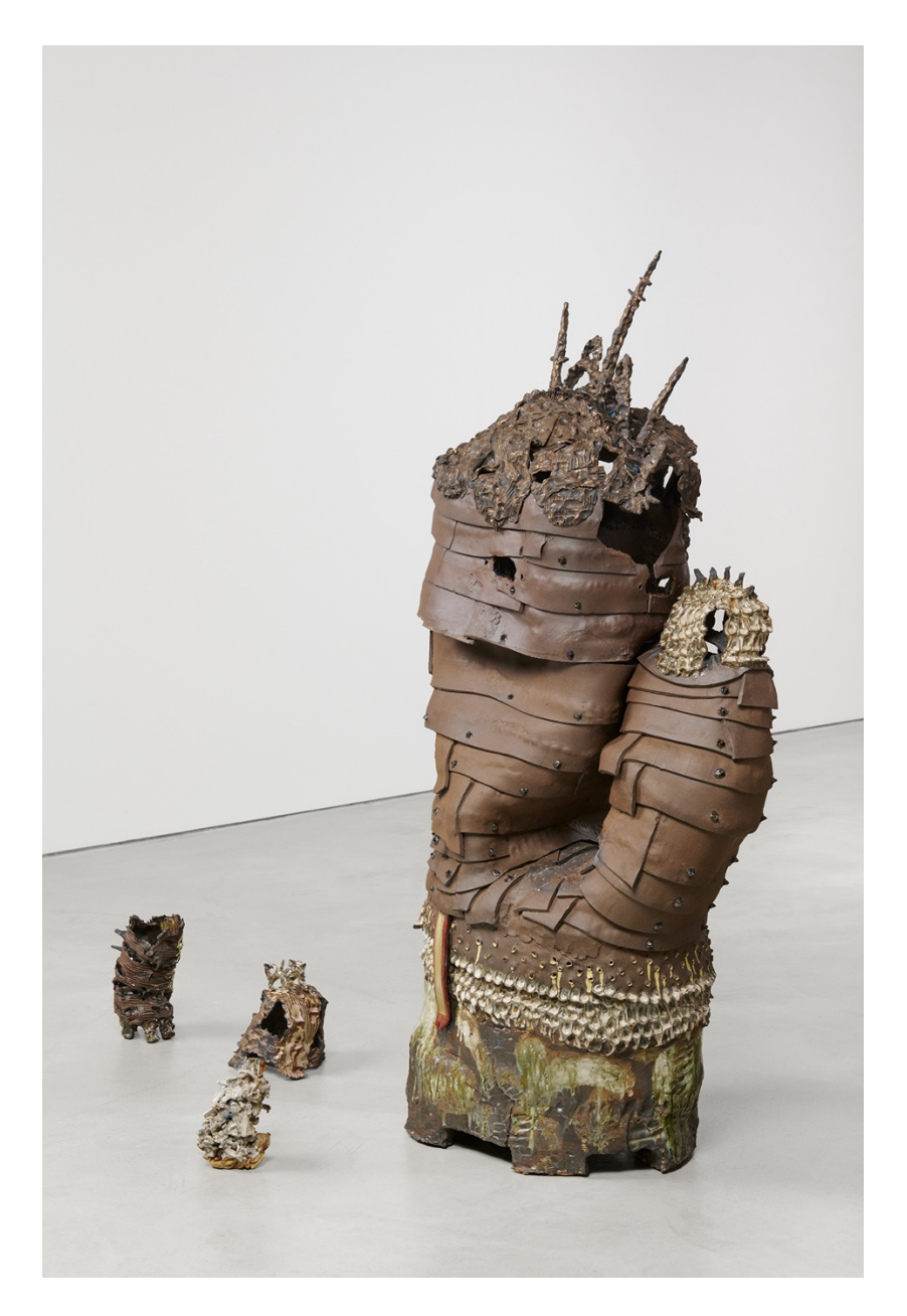
Fig.15 Showing #4, 2024, ceramic

These sculptures are metaphorical swarms issuing from a swaddling of tissues that form the architecture of a body. What surrounds a void will reflexively fill it. Slow tendrils hook into the emotional space of my interior and thoroughly rip it away to form its own other. Asymmetrical figures undergo metamorphosis between the organic and inorganic, a structure navigating between familiarity and fantasy. In the words of Jan Białostocki, this metaphor is a moment of natura naturans: nature as it might become, nature as