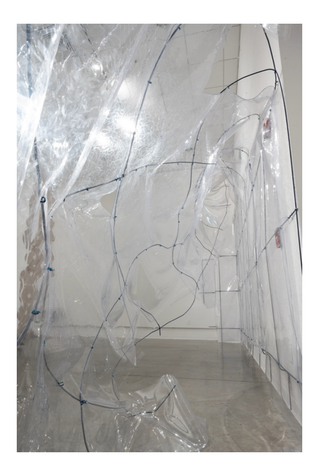
Fig.10 Pellucid(detail shots), 2023