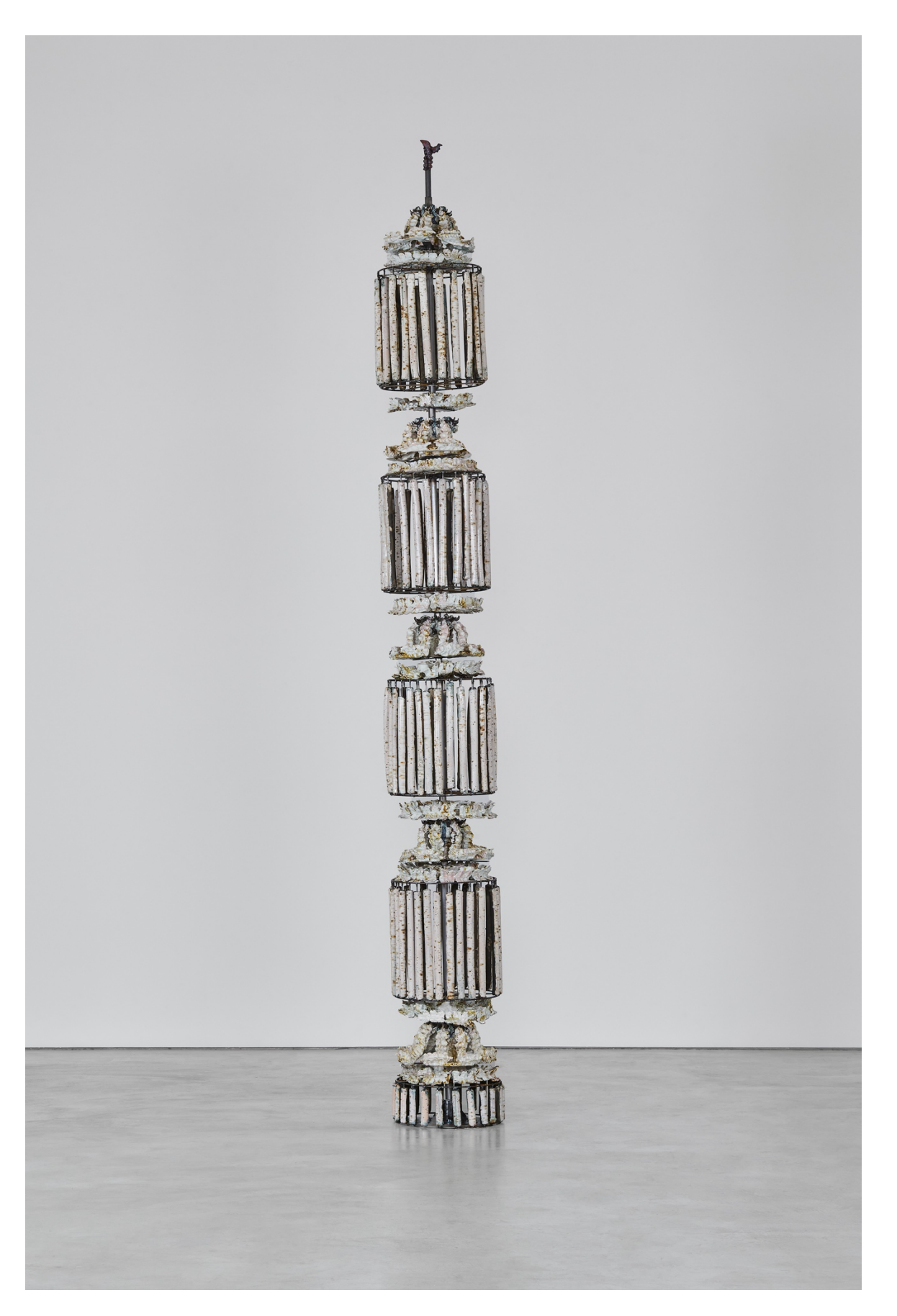
Fig.21 Showing #6, 2024, ceramic and steel