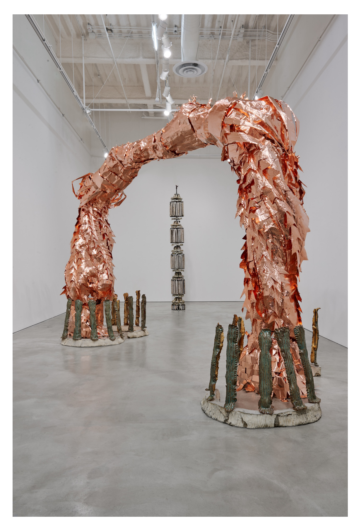
Fig.12 Showing #5, 2024, copper foil, ceramic, concrete