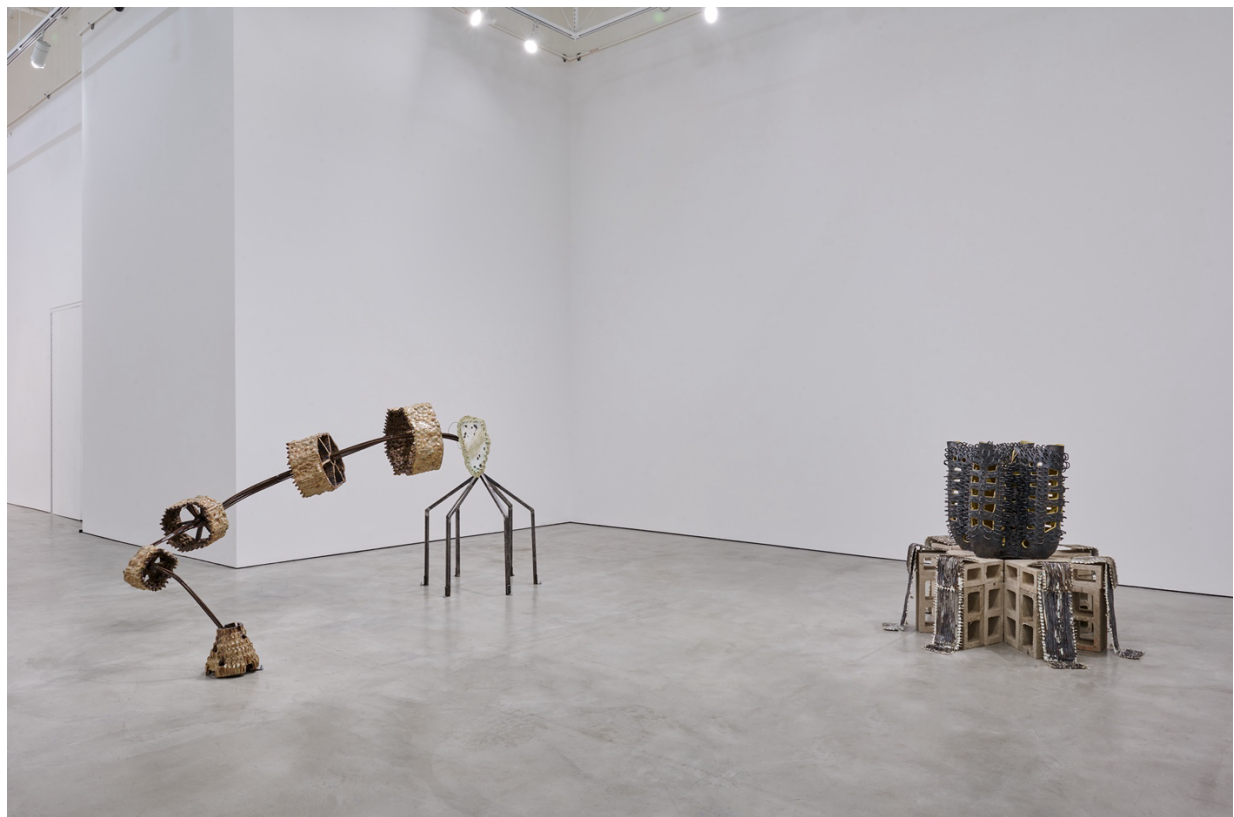
Fig.1 Installation Shot of The Showings (Showing #1(left) and Showing #2(right))