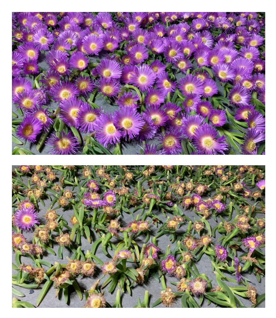
Fig.7 Dying Up on this Hill , 2023, film still, shown at Beall Center for Art and Technology