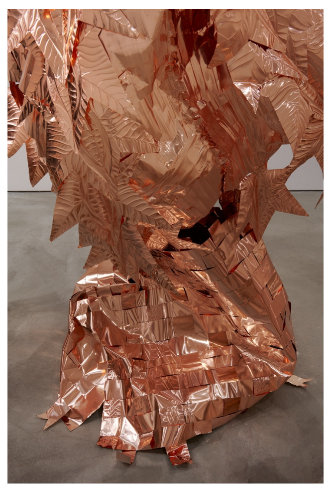
Fig.14 Showing #5(detail), 2024

Before entering into the sections that explore my practice in terms of process, it is essential to note that, like in all good fiction, there is character development/tone . Here, sympathy needs to be cultivated between the character and actor/artist to embody the role of the monstrous, microscopic collective multitude. Sympathy, with a strong Bergsonian resonance, becomes a mechanism of "feeling-knowing" operating in the interior of things, synchronizing its behavior with that of another. The process of sympathy is internal, "felt rather than thought."<sup>6</sup> However, science fiction also supports a model of overstated authorship that presumes that