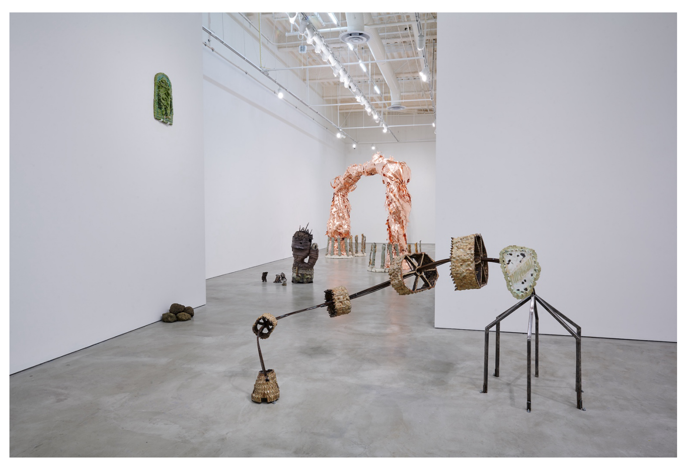
Fig.3 Installation Shot of The Showings (In sequence furthest to the front then back: Showing #2(right), Showing #3(on wall), Showing #4(center), and Showing #5(back))