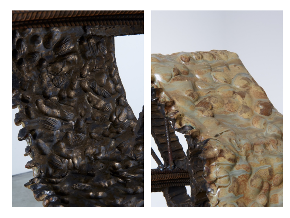
Fig.19 Showing #2(detail), 2024.