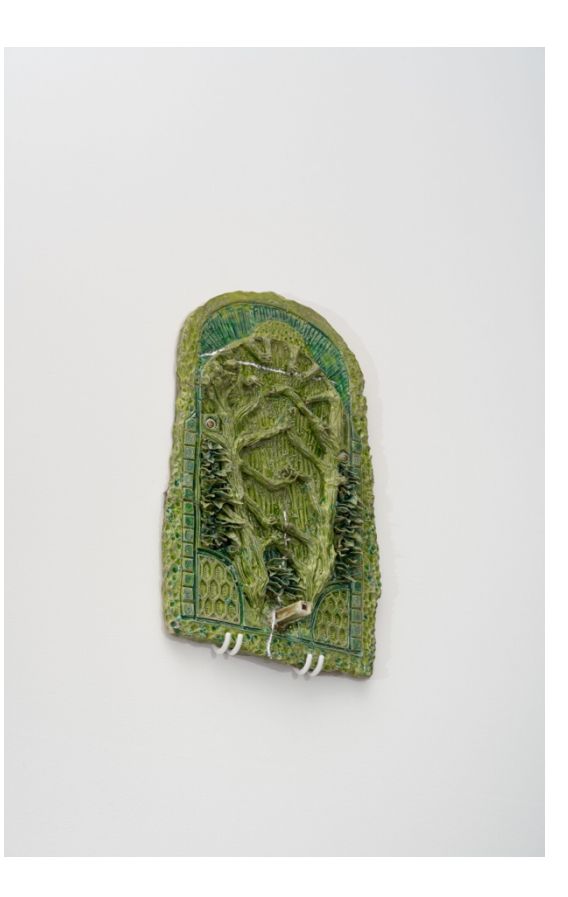
Fig.6 Showing #3, 2024, ceramic

I have been thinking through materialist propositions and thought experiments, where the basic chemical and atomic states offer poignant metaphors for cultural and metaphysical involvement with the world. Secondarily, I have been thinking about how a work can interlace consciousness, fantasy , and imagination to affect and change the perception of the work. Fiction is an entanglement we metonymically live by to engage spatially (or confront our spatial existence). Fiction is a seepage of energy beyond one's materiality and one's perception of it. My work, while embodied, is also