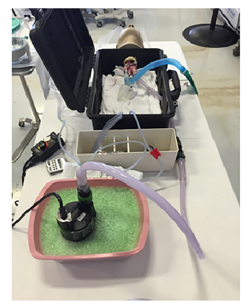
Figure 2. Experimental Setup.

SALAD, Suction Assisted Laryngoscopy Airway Decontamination; IEI, intentional esophageal intubation.