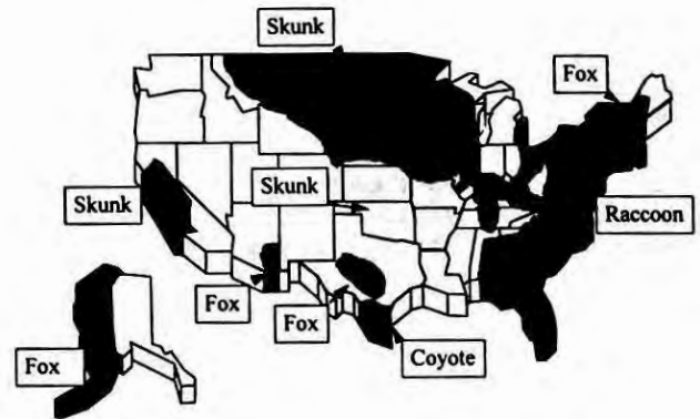
Figure 2. Distribution of the endemic areas for various rabies virus variants with their major terrestrial reservoirs in the United States.

most intensive epizootics of animal rabies ever recorded (Figure 3). The magnitude of this epizootic was enhanced by the spread of virus through naive raccoon populations of very high density, sometimes in states which had not experienced terrestrial rabies for decades (Rupprecht and Smith 1994).