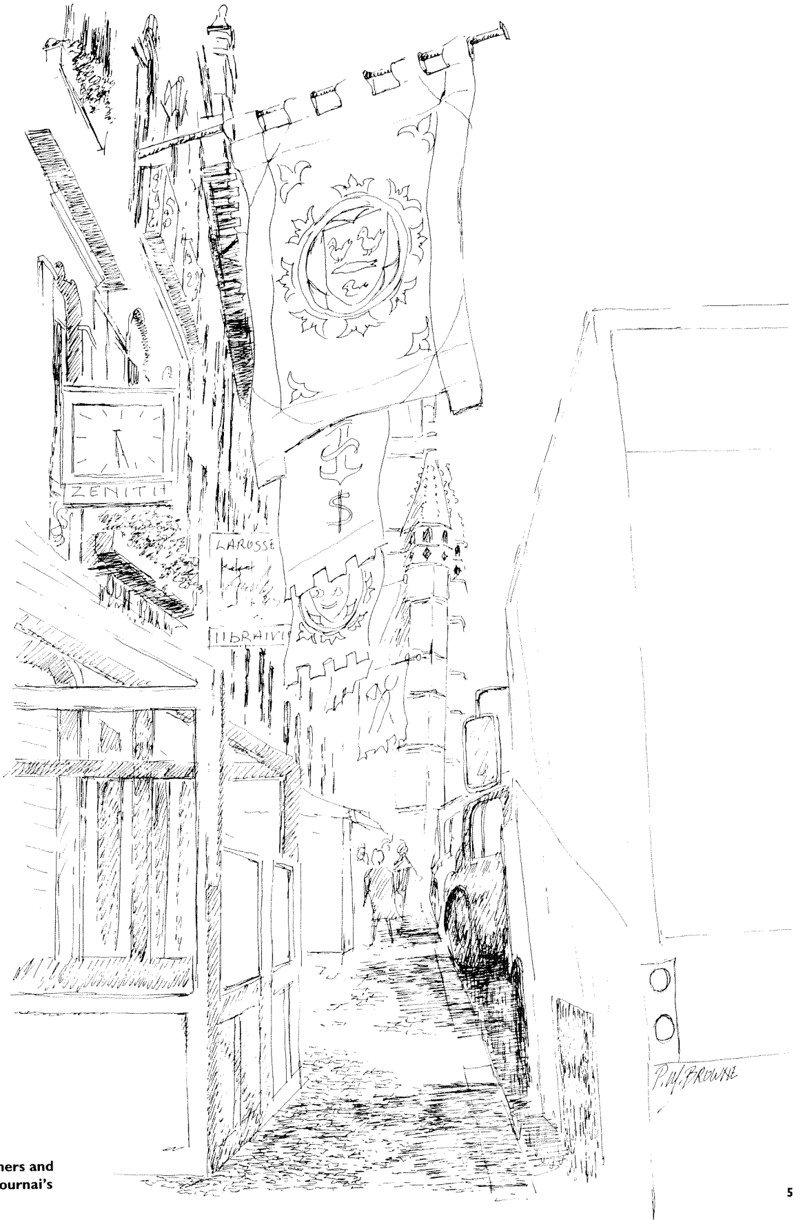
5 Holiday guild banners and circus trucks in Tournai's town square