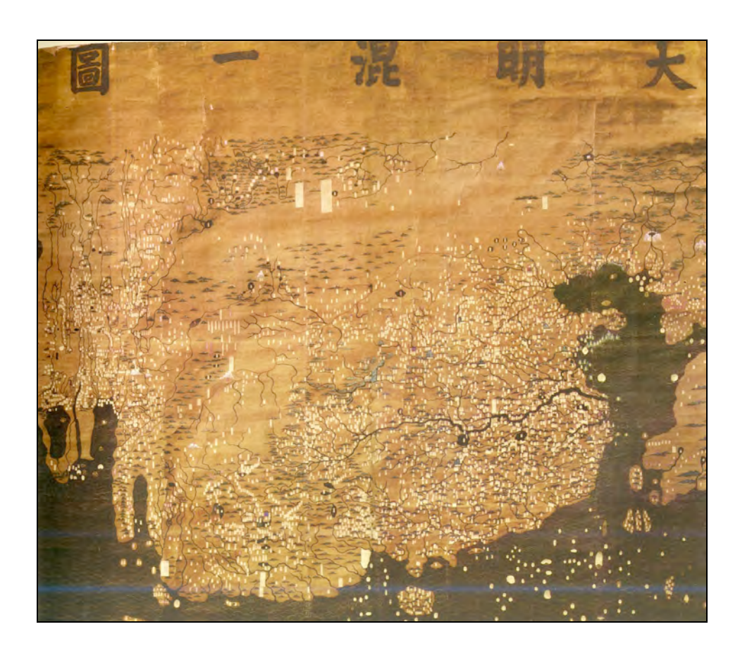
Figure 1. Da Ming Hunyi Tu 大明混一圖 (Amalgamated map of the Great Ming).

Although the Da Ming Hunyi Tu was based on Yuan-era sources imported to China from the Near East in the fourteenth century, materials produced in connection with the Parliamentary Millennium Project conflated the map with the early fifteenth-century expeditions of the Ming admiral Zheng He, as did coverage in the popular press and official Chinese diplomatic statements. By implying that this simple outline of Africa was based on direct observations by Chinese visitors, rather than on imported texts and maps, some commentators seized on the map as proof of early Chinese visits that had taken place without efforts to colonize African territory. In addition to the small reproductions of this map that were included in the PMP, the Chinese government produced a large digital replica of the Da Ming Hunyi Tu , which it presented to the government of South Africa as a gift. The People's Republic of China (PRC), eager to emphasize its anti-imperialist bona fides, proclaimed in diplomatic addresses that this map reflected a more equitable relationship between China and Africa than that manifested by Europe's colonial heritage.