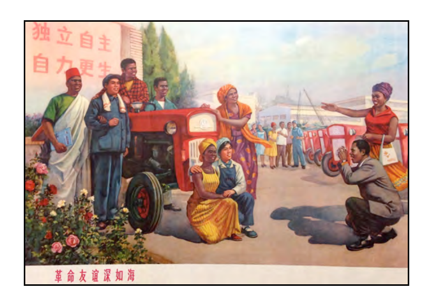
Figure 6. Poster by Guo Hongwu, 1975: Geming youyi shen ru hai 革命友谊深如海 (Revolutionary friendship is as deep as the ocean).

China's relations with South Africa in particular have reflected much of this evolution. During the apartheid era, China called for the release of Nelson Mandela and other imprisoned activists. Strong Soviet support for the African National Congress (ANC) tempered China's eagerness to support that organization, and it favored the competing Black Nationalist Pan Africanist Congress of Azania. Beijing's Foreign Languages Press published booklets of propaganda artwork for international audiences depicting heroic Azanian guerrillas. With Sino-Soviet rapprochement in the 1980s, however, China once again offered its support to the much larger ANC. After Mandela's release, he expressed gratitude for the PRC's support of the anti-apartheid movement, and after his election to the South African presidency, that country's diplomatic recognition of the Republic of China on Taiwan was rescinded in favor of the PRC.