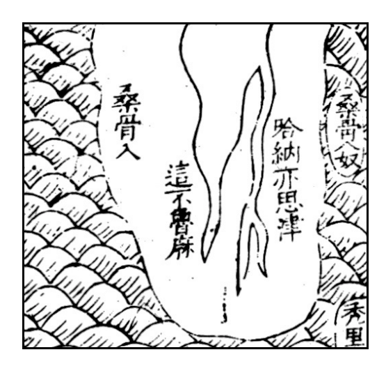
Figure 5. Detail of Africa from the Sancai tuhui 三才圖會 (Illustrated compendium of the three fields of knowledge), 1609. To the west is Sangguru 桑骨入, an erroneous transcription of Sangguba 桑骨八(Zanzibar). Zanzibar is also correctly shown as an island to the east of the continent with the added character 奴 for "Slaves." Zhebuluma 這不魯麻 may be Jabal al-[Qa]mar (Mountains of the moon).

Takahashi's textual analysis shows that the place names from the far western part of the Da Ming Hunyi Tu derive from Arabic names, such as the island of Sanguba, or Zanzibar 桑骨人 off the African coast. If we look more closely at Africa in the Sancai tuhui, we see that Zanzibar appears twice, once on the west coast with an erroneous final character, and again on an island approximating its actual position in the east. The island has an extra character noting that this was a slave market, although the copyist appears to have believed the extra character was part of the name (figure 5). The corruption of toponyms and confusion about their placement reflect common issues that creep in when maps are copied from other maps without any external source to cross-check. This is yet further evidence that this depiction of Africa derives from Islamic sources rather than from direct Chinese observation.