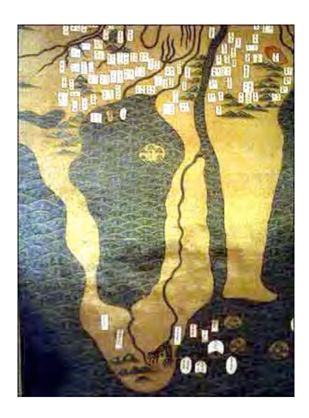
Figure 2. Close-up of Africa as depicted at the far western extremity of the Da Ming Hunyi Tu .

In fact, at the time of this gift, China's relationship with South Africa and its neighbors was undergoing significant transformation. Decades of rhetoric promoting revolutionary solidarity had faded away in favor of commercial ties, especially the extraction of African natural resources for China's industry and construction needs, reciprocated by the sale of Chinese manufactures to these markets. As critics drew attention to the similarities between these economic relations and the age of European exploitation, the PRC was anxious to contrast its economic role with that of earlier European powers. It was in this context that the Da Ming Hunyi Tu entered into discussions of China's relations with Africa.