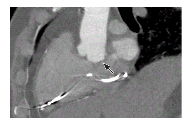
Fig. 2 Coronary computed tomography angiography, sagittal view, postsurgical repair. The prior site of ruptured sinus of Valsalva aneurysm (arrow) after successful repair is noted with no leak.

commonly ventricular septal defect (31%) and aortic regurgitation (44%).¹ It has also been reported in genetic syndromes including 22q11.2 deletion (DiGeorge syndrome), Down syndrome, Wildervanck syndrome, and Noonan syndrome. There is 1 known case report on SOVA in a patient with trisomy 13.² To the best of the authors' knowledge, this case report is the first of a SOVA rupture secondary to Streptococcus viridians endocarditis in a patient with trisomy 13 syndrome.