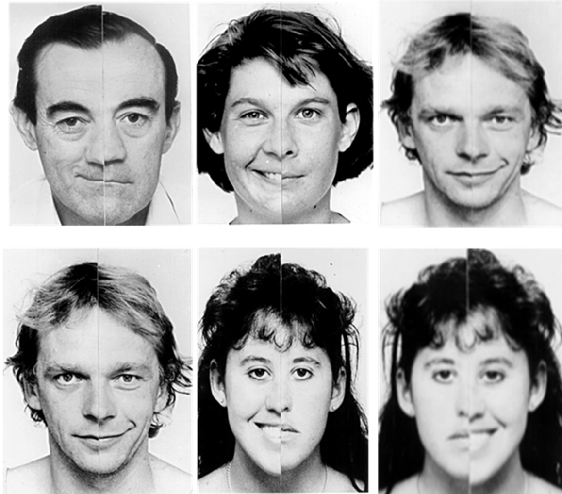
FIGURE 1 | Examples of the sex determination test (SDT). SDT examples in response to the question: “ARE THE TWO PEOPLE OF THE SAME SEX?” (left) “yes”; two males (center) “yes”; two females (right) “no”; male (top) and female (bottom).

event a participant responded within <2 s before the presentation of the next stimulus, that interval was used for the recording time. Instances where a participant made no response before the presentation of the next stimulus were discarded.