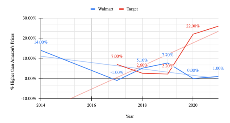
Graph 3: Price Differentials with Amazon in Beauty Products

Profitero's price data suggests brick-and-mortar retailers like Walmart and Target have, to varying degrees, competed with Amazon on prices at different points in the last decade. Based on this limited data, two trends appear: (1) the price differential trendline for Walmart relative to Amazon (indicated by the light blue lines in the graphs) has decreased since 2014 and (2) the price differential trendline for Target (indicated by the light red lines in the graphs) has increased over time. While the continuing existence of a price gap between Walmart/Target and Amazon may suggest there has been no price disciplining, the fact that the gap between some retailers and Amazon has been decreasing (in some product categories more than others) suggests that there has been some effect on prices. Assuming Amazon has not been raising its prices, the decreasing price differentials between retailers like Walmart and Amazon throughout the years suggest that Walmart has been responsive to Amazon's prices.