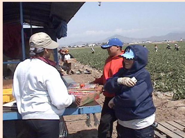
Top: Workers fill strawberry flats and carry them along the row...