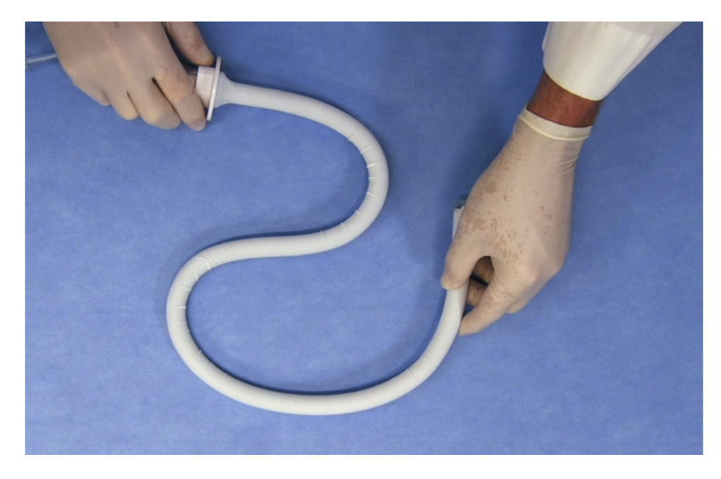
Figure 1. This image shows the flexibility of the dynamic rigidizing overtube. In its flexible state, it allows smooth movement of the overtube over the colonoscope.

A 72-year-old man presented for surveillance colonoscopy. A pediatric colonoscope was successfully advanced to the ascending colon but could not be advanced farther because of loop formation. Making the situation worse, every time the colonoscope was advanced through the loop, the patient became bradycardic to a