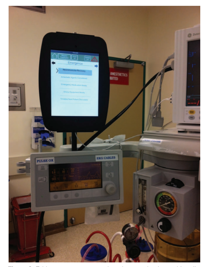
Figure 2. Tablet computer mounted on the anesthesia machine displaying routine and crisis anesthesia checklists at San Francisco General Hospital.

To better understand factors affecting checklist adoption and usage, we conducted an anonymous electronic survey 8 months after implementation. The survey was approved by our local IRB, and requirements for written informed consent were waived (University of California, San Francisco,