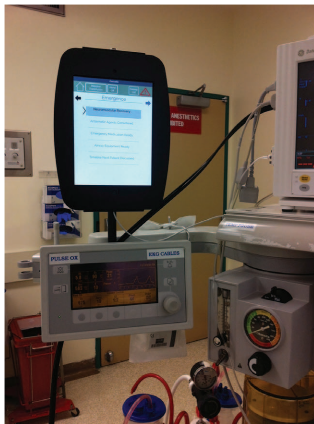
Figure 2. Tablet computer mounted on the anesthesia machine displaying routine and crisis anesthesia checklists at San Francisco General Hospital.

To better understand factors affecting checklist adoption and usage, we conducted an anonymous electronic survey 8 months after implementation. The survey was approved by our local IRB, and requirements for written informed consent were waived (University of California, San Francisco,