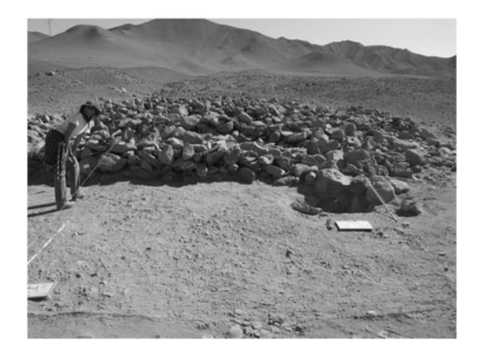
FIGURE 3 Omo-style cemetery, M70B aboveground cairn