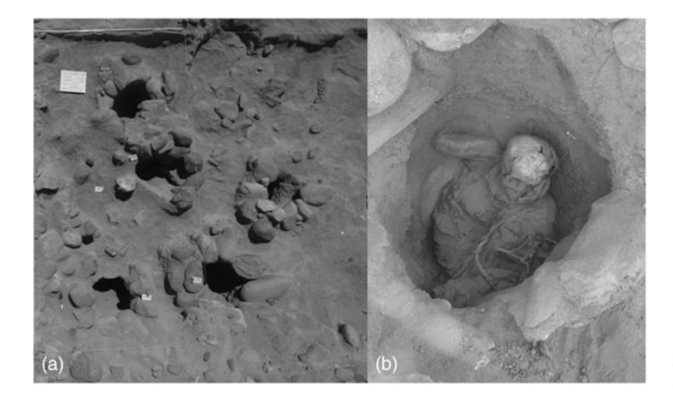
FIGURE 2 Chen Chen-style tombs, (a) Rio Muerto site M43A unit J and (b) below-ground seated flexed burial M43A-58

tent-like architecture. They contained relatively little infrastructure or tools for agricultural processing and were situated close to long-used and well-marked trade routes for llama caravans that avoided farmland and the local Moquegua River floodplain (Goldstein, 2005; Goldstein, 2015). Omo-style cemeteries were also distinct in that they had significant aboveground structures, suggesting easily visible marked burial grounds (Figure 3). Strontium isotope paleomigration analyses showed many Omo-style burials with intermediate values from between the altiplano and the Moquegua Valley, suggesting lifelong movement between these two regions (Knudson et al., 2014).