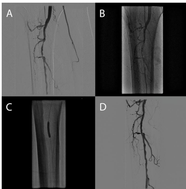
Figure 3. Right Lower Extremity below the Knee Robotic Revascularization.

more these lesions are ideal targets for robotic intervention with the currently available system. The size of the target infrapopliteal vessels typically requires the use of coronary interventional equipment including balloons and 0.014-inch guide wires, which are compatible with the current CorPath 200 system, and they are often treated with balloon angioplasty alone. Behnamfar et al. recently reported the first case of successful percutaneous management of below-the-knee PAD using robotically assisted balloon angioplasty with the CorPath 200 system. 40 Successful balloon angioplasty was performed using this system for a 56-year-old man with a focal stenosis in the tibioperoneal trunk and proximal peroneal artery. The procedure was performed without any complications, demonstrating that robotic PVI can be performed for below-the-knee disease (Figure 3). However, further clinical data are required fully to examine the safety and effective-