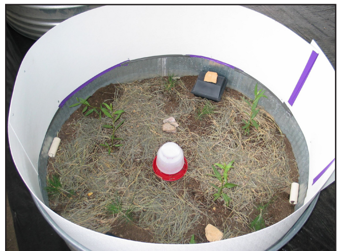
Figure 1. The stock tank set-up for the seedling damage trials.

We planted and monitored seedlings of a coniferous species, ponderosa pine ( Pinus ponderosa ), and a deciduous species, narrow-leaf cottonwood ( Populus angustifolia ) in 8 metal stock tanks containing about 7 inches of topsoil and occupied by 4 deer mice or 4 house mice, to assess the potential for damage by these rodents (Figure 1). One male and 3 female mice were used in each