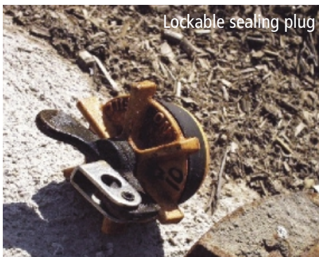
Figure 3. Well box, access pipe with water level measurement mark, and lockable plug of a monitoring well.

Access to production wells can be more difficult. Ideally, a sample valve or spigot will be located in the water pipeline between the well-head and the water storage or pressure tank. In many domestic wells, however, the closest access to water from the well is at the exit point of the water pressure tank or at a water faucet inside the house. When testing ground water, the water sample ideally should not be collected from the tap. If the house is on a water treatment or water softening system, either of which involves chemical alteration of the water, the sample should be taken at a point in the distribution system that comes before the water enters any treatment and as close to the well as possible. If you can only draw a sample at the outflow of a pressure or storage tank, you should flush the tank prior to sampling (see below).