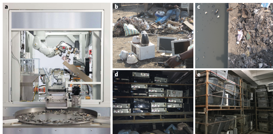
Fig. 1 | Approaches to electronic waste dismantling. a–e , There is a marked difference between formal e-waste dismantling, such as Apple’s Daisy robot ( a ), and manual dismantling, such as that in the Agbogbloshie market sector in Accra, Ghana ( b ). Informal e-waste resource recovery leads to environmental pollution ( c ), while stockpiles of e-waste awaiting recycling in government-approved facilities on the outskirts of Beijing, China, continue to grow ( d,e ), requiring urgent solutions.

It is increasingly clear that top-down regulatory approaches are not effective for international management of e-waste, which has high-value content amenable to inefficient and unsafe rudimentary recycling in emerging market economy countries. Engaging the private sector, including manufacturers, retailers and labour investors, is necessary to stimulate the development of innovative solutions that will bring the extensive informal sector