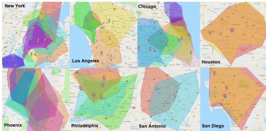
Figure 1 Urban trauma center density. Plots the level 1 and 2 trauma centers in 8 of the largest 15 cities in the USA. Colored polygons represent 20 min drive radius of the level 1 trauma centers. Online supplemental materials include all cities mapped.