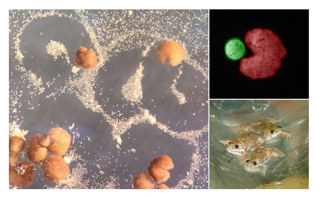
Figure 2: An example of hybrid entities is the Xenobot, an in vitro self-replicating biological robot. The version 3.0 follows the original Xenobots reported in 2020 as the first living robots, and Xenobots 2.0, capable of self-propelling using cilia and maintaining memories. Synthesized from frog cells, these computer-designed living machines are able to navigate aqueous environments in different ways, forage for single cells, heal after damage, and show emergent group behaviors (Blackiston et al., 2021).