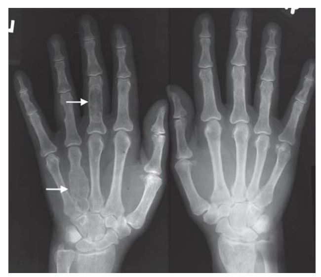
Figure 2. Radiograph of the hands of a 55-year-old patient with renal osteodystrophy and brown tumors of the fourth metacarpal and third phalanx of the left hand (arrows).

In CKD, chronic stimulation of the parathyroid glands triggers diffuse polyclonal hyperplasia. As the chronic stimulation of CKD continues, the parathyroids begin to develop monoclonal nodules within a background of parathyroid hyperplasia. These nodules demonstrate increased resistance to vitamin D and calcimimetic medications and may be the etiology of the loss of negative feedback seen in 3° HPT.<sup>18,19</sup>