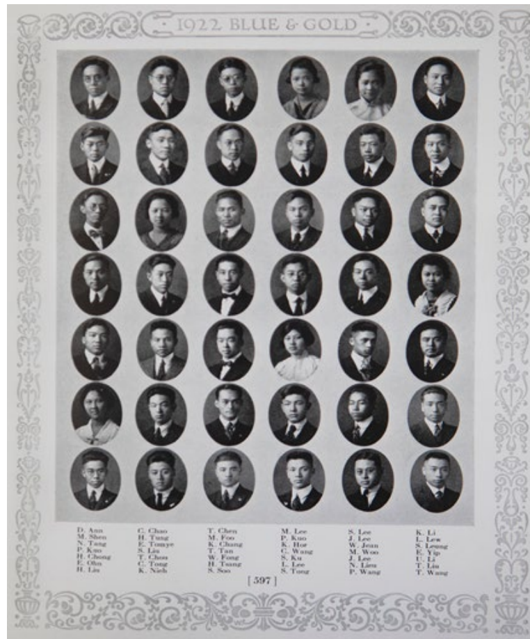
Figure 4: “Chinese Students Club”