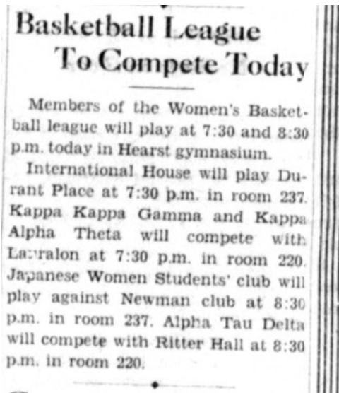
Figure 7: "Basketball League to Compete Today"