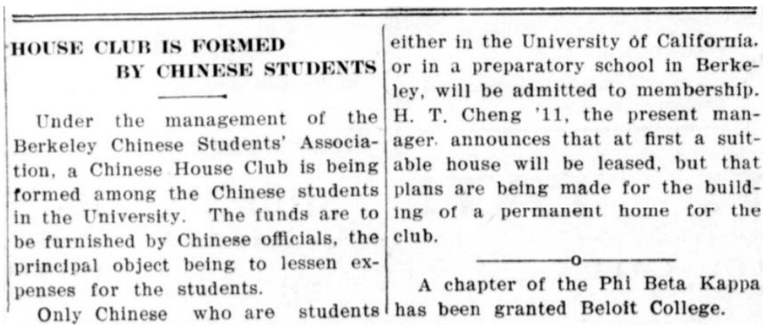
Figure 3: "House Club is Formed by Chinese Students"

In 1902, "twenty-three students from Berkeley, Oakland, and San Francisco met" and organized the Pacific Coast Chinese Students' Alliance. (Bieler, " Patriots: or 'Traitors' " 171). This is the first Chinese or Japanese American student organization we can identify as coeducational; both women and men students assumed leadership positions. Among many other female leaders, there was a woman from the University of California in the editorial department of the CSA's publication, The Chinese Students' Monthly , in 1913 ("Editorial Department," The Chinese Students' Monthly 1913 10) and a woman Vice President of the UC chapter in 1923 ("University of California," The Chinese Students' Monthly 1923, 73). This bay area organization was the first of multiple regional Chinese Students' Alliance chapters, and a Berkeley city club was established in 1904 (Bieler, Patriots or Traitors 171). A nationwide alliance between these regional chapters was established in 1911. By 1914, there was a University of California Chapter ( The Chinese Students' Monthly 1914, 316) and an "Annual Conference of Orientals" ("Chinese Students Now in Convention" 18). The nationwide alliance ended in 1931, "leaving only local clubs as a residue" (Bieler, Patriots or Traitors 172).