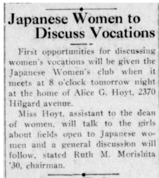
Figure 6: "Japanese Women to Discuss Vocations"