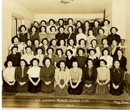
Figure 8: UC Berkeley Japanese Women's Club Fall 1938