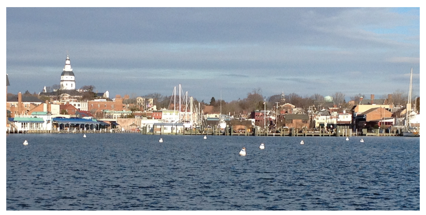
FIGURE 1. The Maryland Statehouse overlooks downtown Annapolis with its working waterfront, a critical component of the city's history, culture, economy, recreation, and future.

its small-town ambience. The combination of a historic city with an active recreational waterfront ensures that Annapolis remains as a city with a high quality of life.<sup>4</sup>