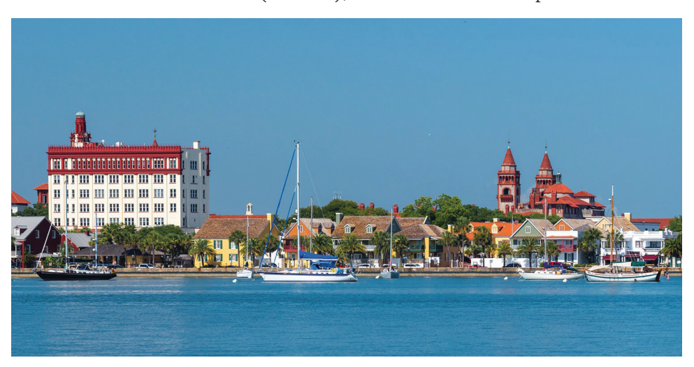
FIGURE 3. Idyllic downtown St. Augustine, Florida, and its Spanish Colonial National Historic Landmark District along the Matanzas River/Atlantic Intracoastal Waterway face sunny day flooding and have witnessed 5 inches of sea-level rise in the past 25 years. Photo courtesy Stacey Sather, SGS Design & Art, Inc., "Downtown St. Augustine waterfront and seawall," August 2019.

In preparing a Cultural Resource Hazard Mitigation Plan (CRHMP), FEMA considers the special status