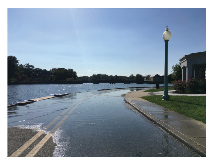
FIGURE 2. United States Naval Academy sunny day flooding: Ramsey Road on September 20, 2017, during high tide. The road frequently floods and has to be closed by security. This impacts memorial ceremonies and internments at the Columbarium, as well as impeding traffic to and from the faculty parking lots on Hospital Point. Historic Hubbard Hall is in the background.

Spanish St. Augustine, founded in 1565, is the oldest continuous European and African-American city in the United States, with archaeological resources dating back 14,000 years. St. Augustine is the first city designed on Spanish King Phillip II's 1573 Laws of the Indies. The plaza was the center of the city geographically, symbolically, and socially and continues in that