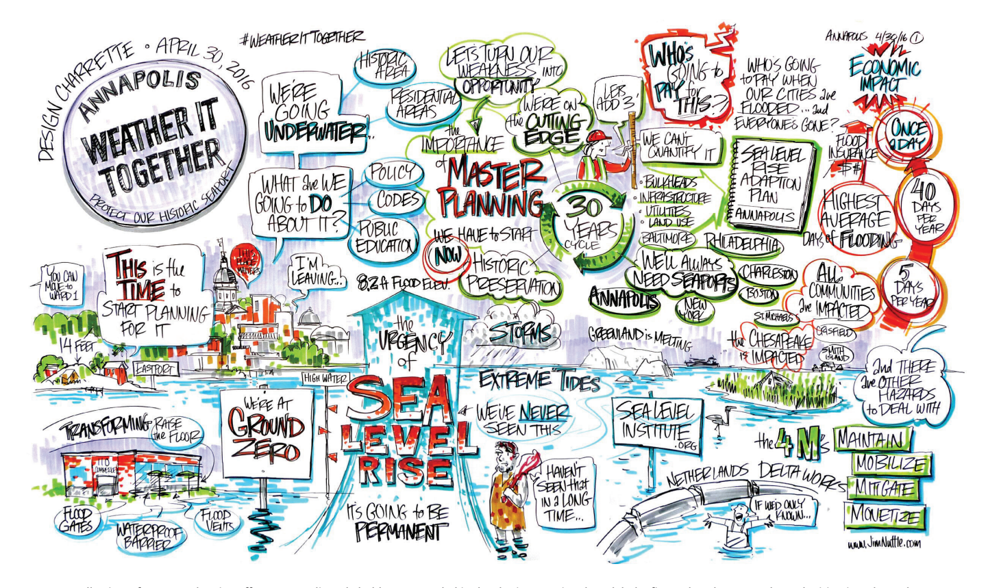
FIGURE 5. Following a four-year planning effort, Annapolis stakeholders succeeded in developing a national model, the first cultural resource hazard mitigation plan to be approved by FEMA. "Weather It Together" Planning Charette, April 30, 2016.

to the larger community. The Annapolis plan envisions protection of the natural heritage of the Chesapeake Bay, prioritizes preservation of historic properties with significant community value, demonstrates the importance of partnerships with public agencies and private stakeholders to reduce the costs and impacts associated with flood protection and flooding hazards, and promotes both short-term and long-term strategies for flood protection.