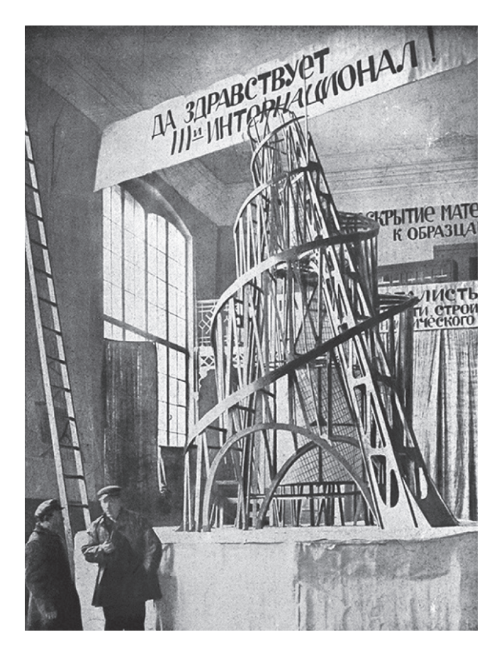
FIGURE 1.2 Vladimir Tatlin beside his Monument to the Third International (1920).