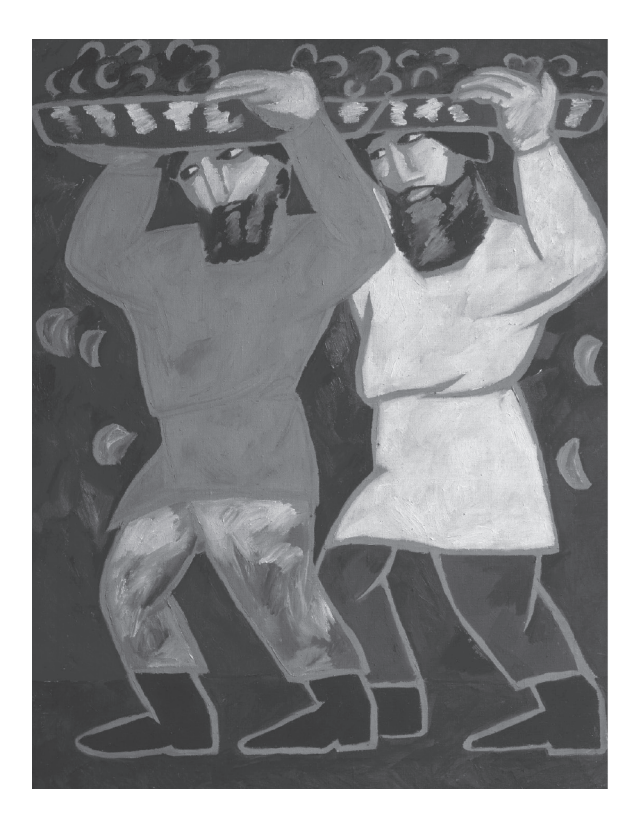
FIGURE I.5 Natal'ia Goncharova, Peasants (1911).