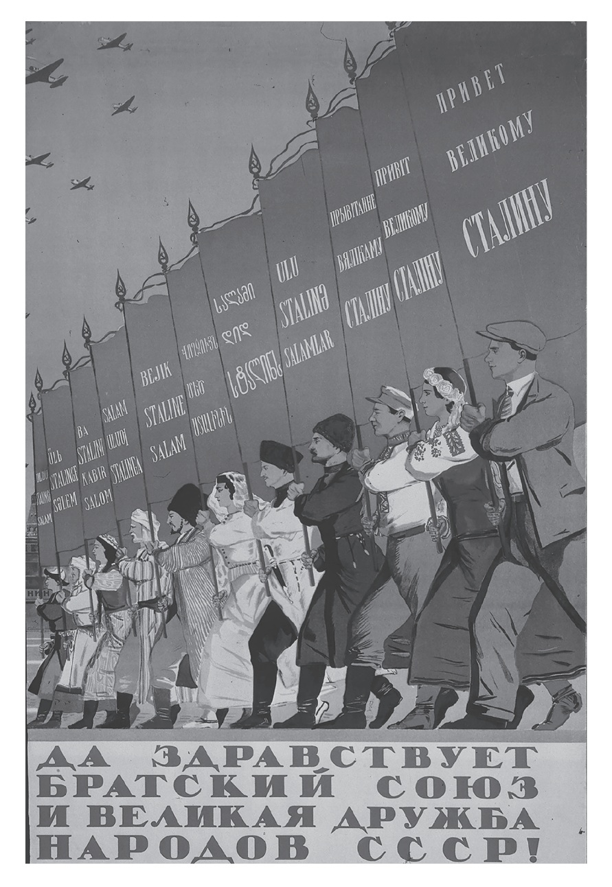
FIGURE 1.1 "Long Live the Fraternal Union and Great Friendship of Peoples of the USSR!" Soviet poster illustrating "national form, socialist content" (1936).