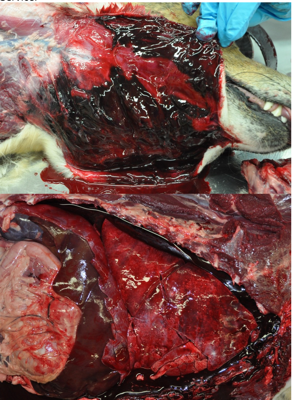
Figure 4 . Necropsy images from a 3 year-old male Greyhound mix that was diagnosed with B. conradae but died suddenly prior to treatment. Post mortem findings included multisystemic (including mandibular – A) and cavitary (B) hemorrhage despite only a moderate thrombocytopenia (122,000/ \mu L).