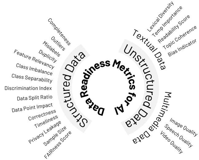
Fig. 2. 360° View of Mapping Data Readiness Dimensions for AI.

This section presents a comprehensive summary of the existing metrics in the literature used to measure DRAI. We will explore these metrics for both structured and unstructured data, primarily focusing on structured data for which metrics have evolved more. Nevertheless, we describe many metrics related to assessing readiness of unstructured